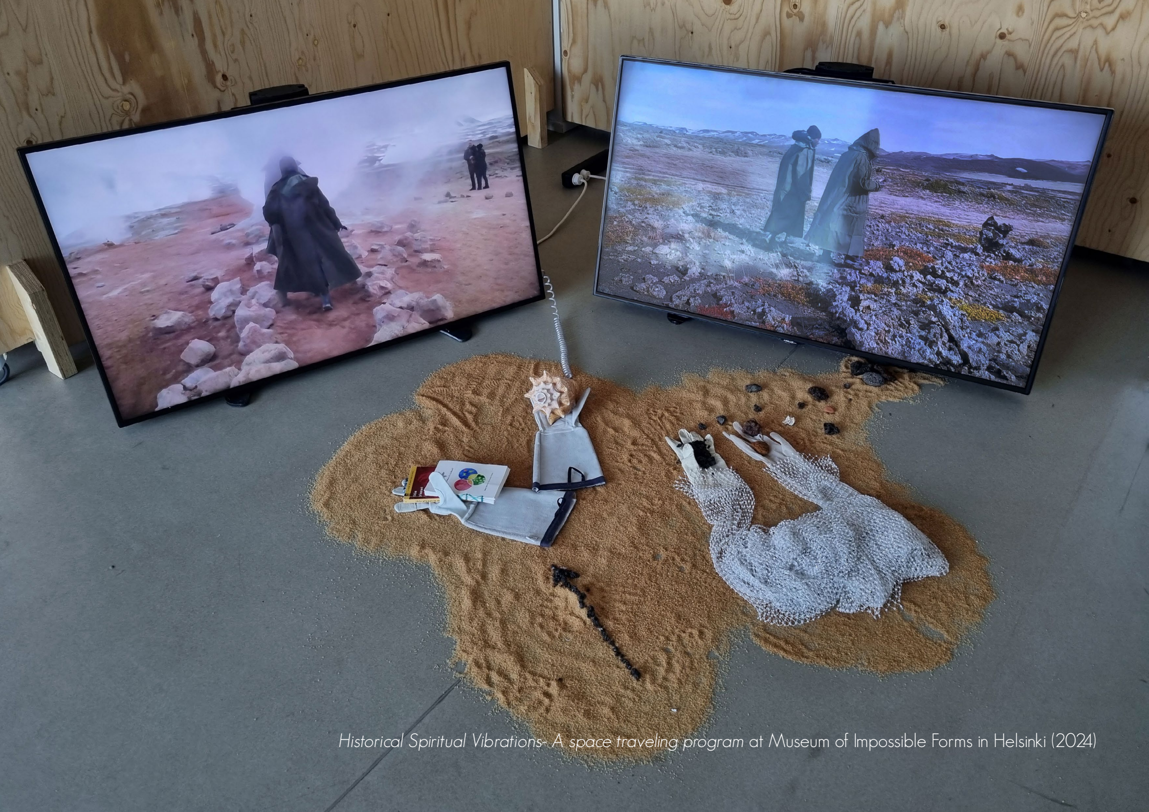
Historical Spiritual Vibrations- A space traveling program at Museum of Impossible Forms in Helsinki (2024)