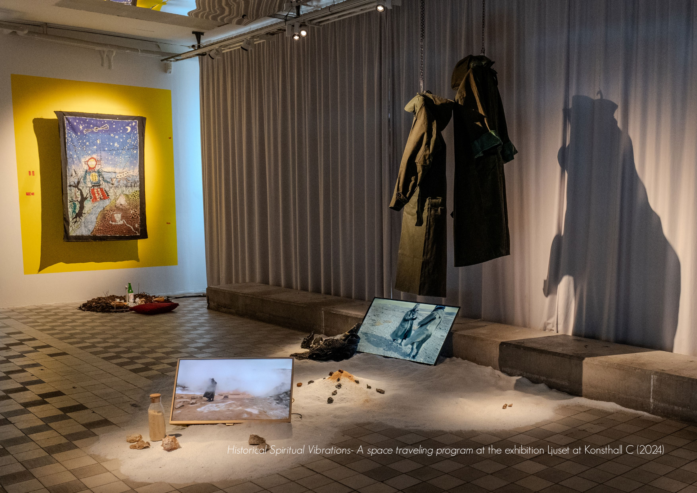
Historical Spiritual Vibrations- A space traveling program at the exhibition Ljuset at Konsthall C (2024)