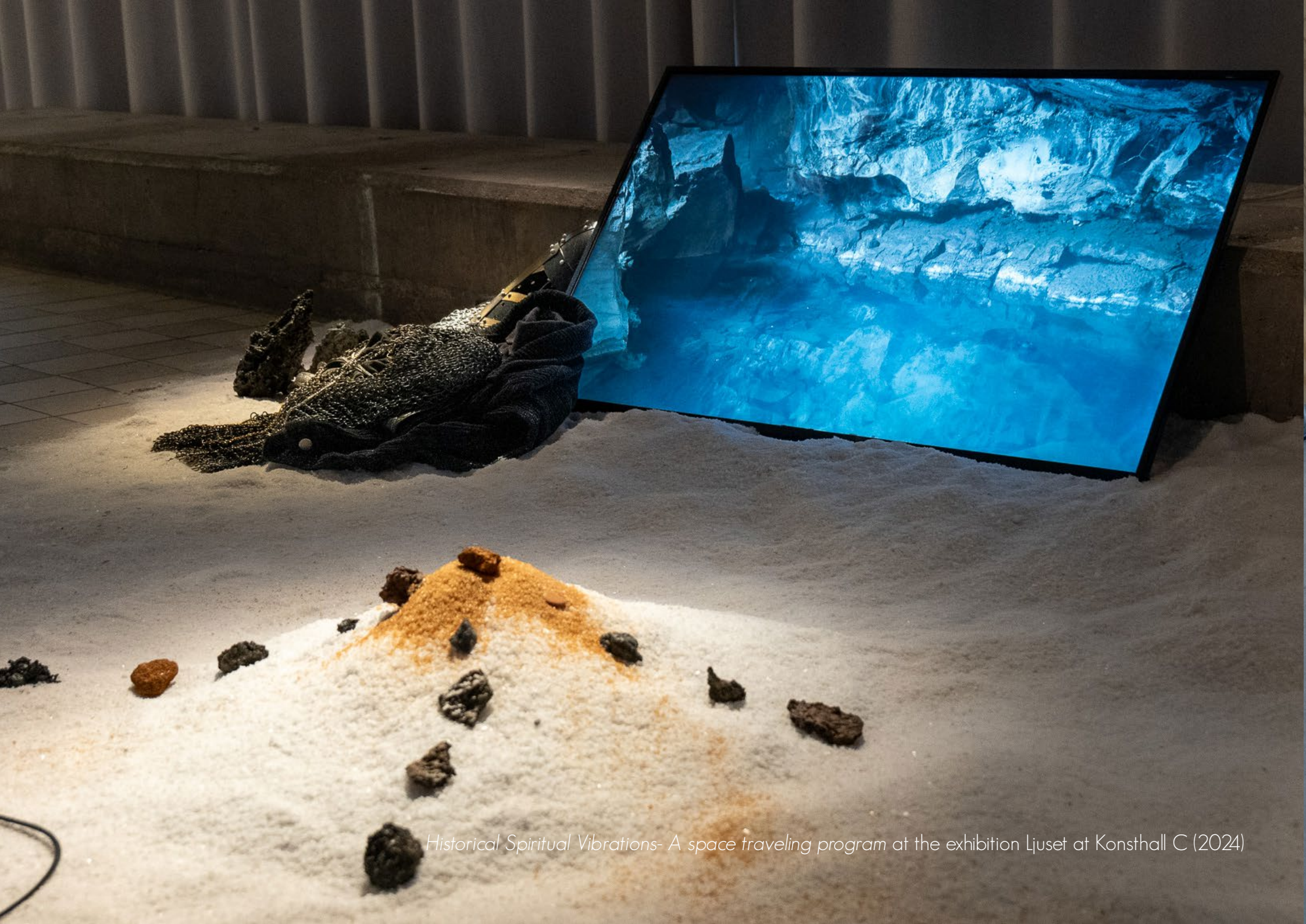
Historical Spiritual Vibrations- A space traveling program at the exhibition Ljuset at Konsthall C (2024)