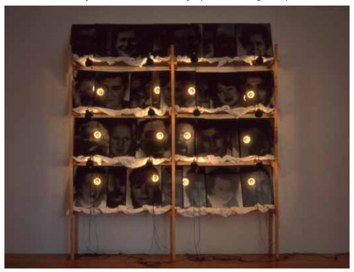
Christian Boltanski, Archive Dead Swiss, 1990 Photographs, lamps, white linen, wooden shelves 128 x 110 1/2 x 22 1/2 in. (325.1 x 280.7 x 57.2 cm)

Boltanski's work oscillates between inert collections and arrangements of conservation, sometimes pushing his concerns to perverse extremes, blurring the line between the fictive and the historical. In a series of works titled Detective, he draws from a popular French magazine of the same name that details a world of infamy in which crime is vicariously experienced through the spectacle of media