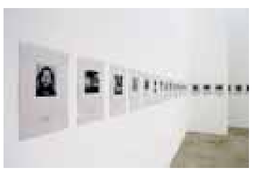
Hans-Peter Feldmann, Die Toten, 1967–93 , 1998 90 works Dimensions variable Courtesy 303 Gallery, New York © 2007 Artists Rights Society (ARS), New York / VG Bild-Kunst, Bonn

lic? With no accompanying commentary, this material collected from different media sources, in different nations, cities, and languages, implicitly asks the viewer whether it can be treated as a work of art or merely a kind of public testimony. As a work concerned with public memory and media imagination, 9/12 Front Page addresses the intersection of iconographic shock and spectacle—such as Zapruder's footage of the assassination of President John F. Kennedy; it also explores the terms around which photography mediates history and document, event and image. Or how media intervene into the archive and public memory. Buchloh's formulation of the "anomic archive," exemplified by Richter's Atlas, versus the utopian project of photomontagists of the later