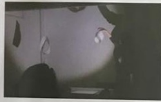
683978 Performing the Acrostic 12/20/2010 10:00 AM