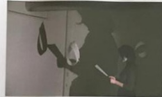
683977 Performing the Acrostic 12/20/2010 10:00 AM