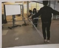
687588 Photograph of a person in a classroom setting.