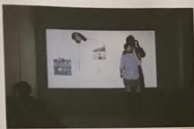
683995 Naked Woman in a Garden 01/20/2010 10:00 AM