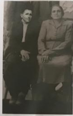
687930 Photograph of two people sitting together.