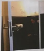
683982 The Thinker in a Garden 01/20/2010 10:00 AM