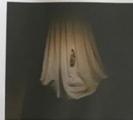
683983 The Thinker in a Garden 01/20/2010 10:00 AM