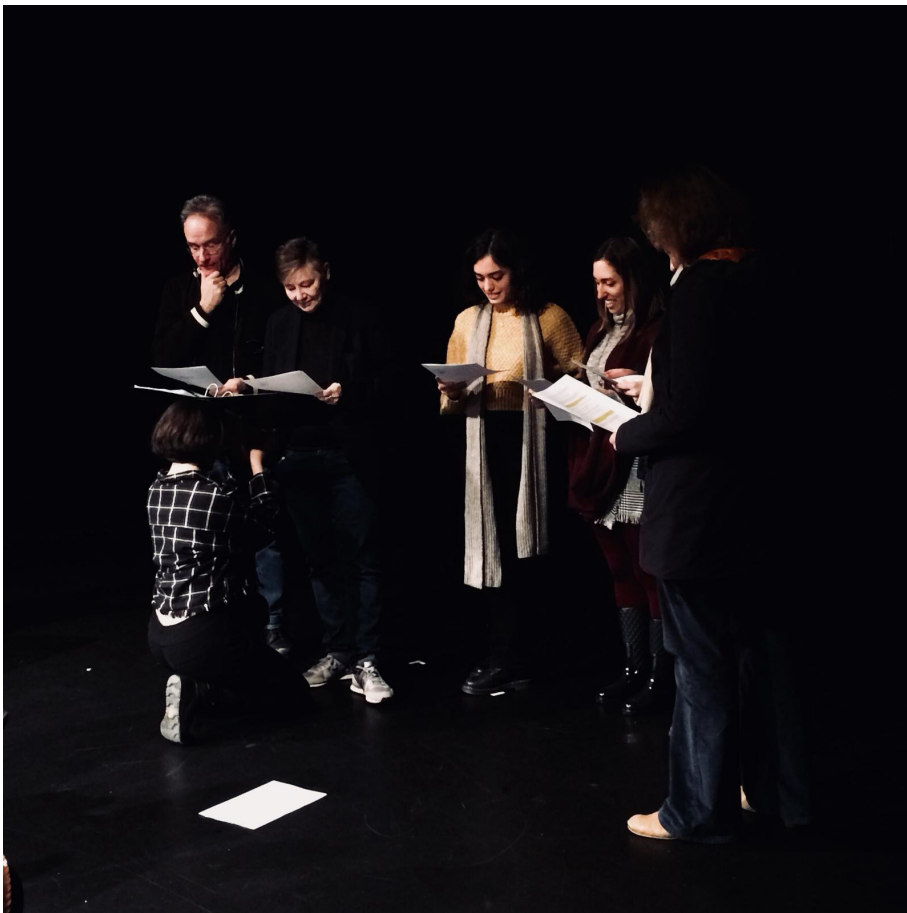
Performance of the script by members of the audience during the 3.0doc.