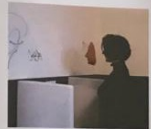
683980 The Thinker in a Garden 01/20/2010 10:00 AM