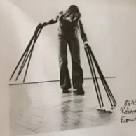
683997 Naked Woman in a Garden 01/20/2010 10:00 AM