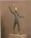
684001 Naked Woman in a Garden 01/20/2010 10:00 AM