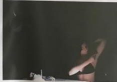
683979 Performing the Acrostic 12/20/2010 10:00 AM