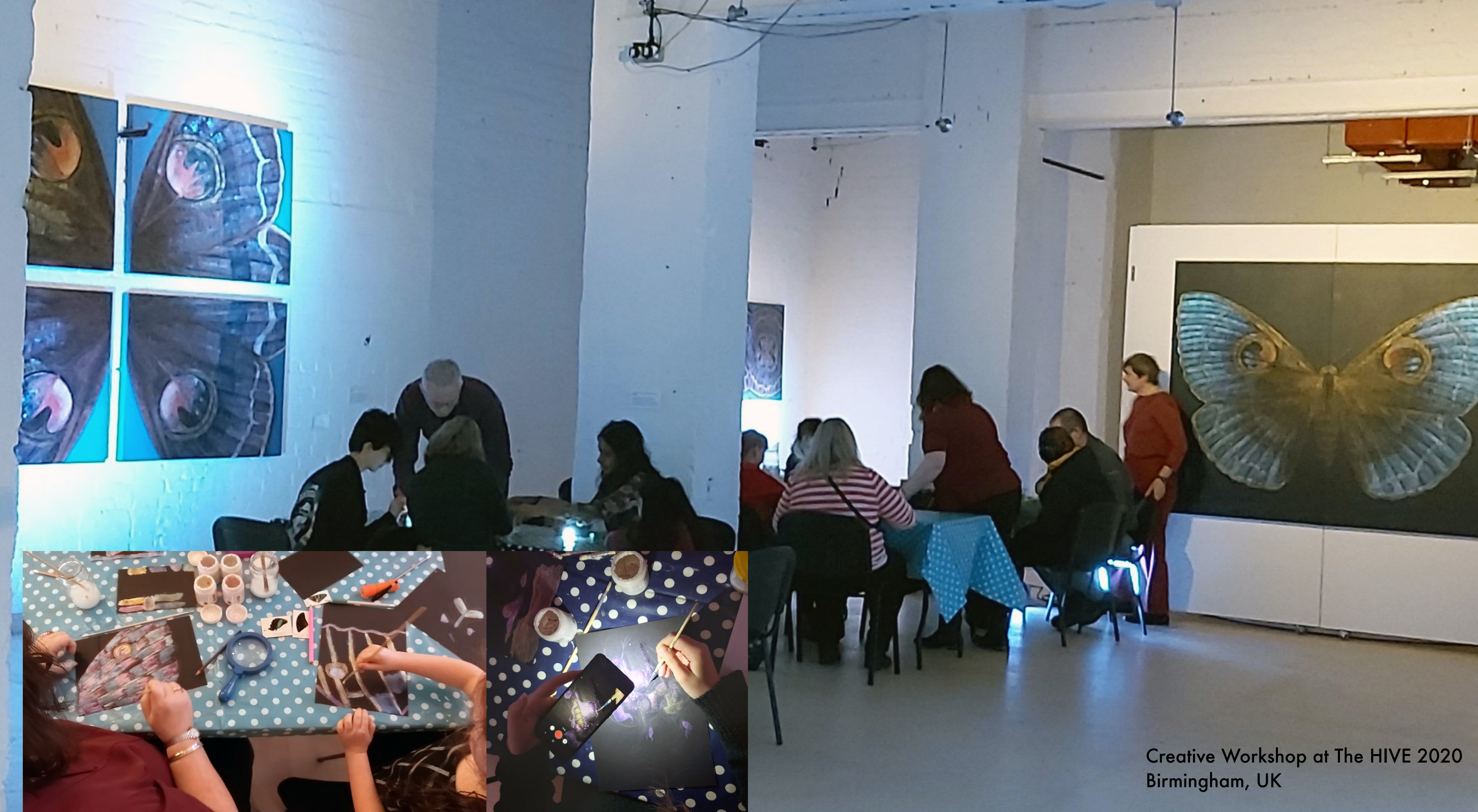
Creative Workshop at The HIVE 2020 Birmingham, UK