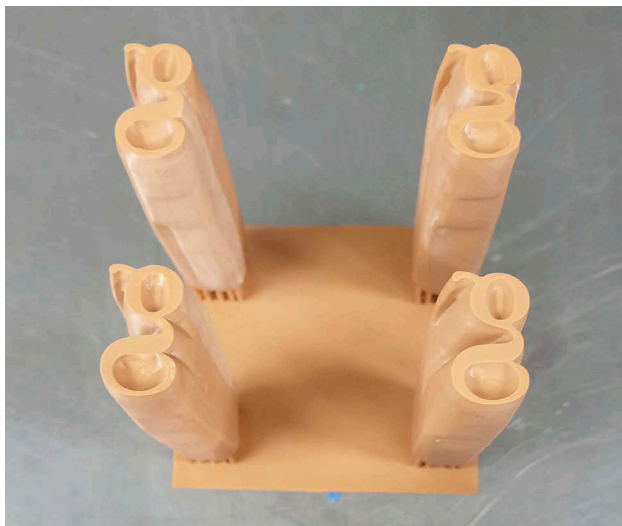
Figure 3. Three-dimensional polymer printed models of Baskerville's 60pt punches, produced in the centre for digital design & manufacturing, school of jewellery, Birmingham City University.

Through handling the punches, feeling their weight and sensing their scale, we were able to get an impression of the punches as working tools. Using RTI, laser scanning and 3-D printing in combination we added to the haptic impressions by successfully capturing hitherto unseen features from the surface of the punches. Using just a single method of observation would not have provided such detail. An initial examination of the sample images revealed lines invisible to the naked eye. Some of these lines are evidence of high usage and show how the edges of the punches were worn away over time. The variations in the marks also reveal that multiple hands, with differing levels of skill, produced the punches. This starts to tell us something more about the size of Baskerville's workshop and the numbers of people he employed and their varying levels