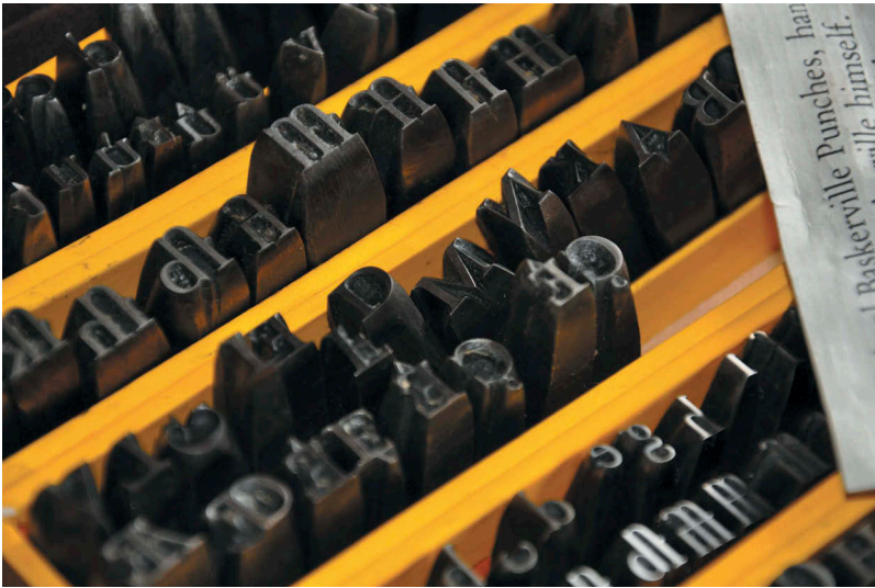
Figure 2. The Baskerville punches, in the historical printing room, Cambridge University Library.

French-made replacements for those originals which were either damaged and discarded or were lost. Other punches are eighteenth-century additions made to provide the diacritical marks required for the printing of Beaumarchais's Kehl edition of Voltaire. Others are twentieth-century French-made supplements. The collection includes punches for both roman and italic and upper and lower-case characters, with figures and punctuation marks in seventeen sizes: