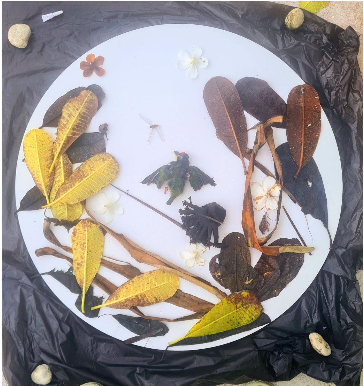
"Bird \rightarrow \infty " canvas in progress"