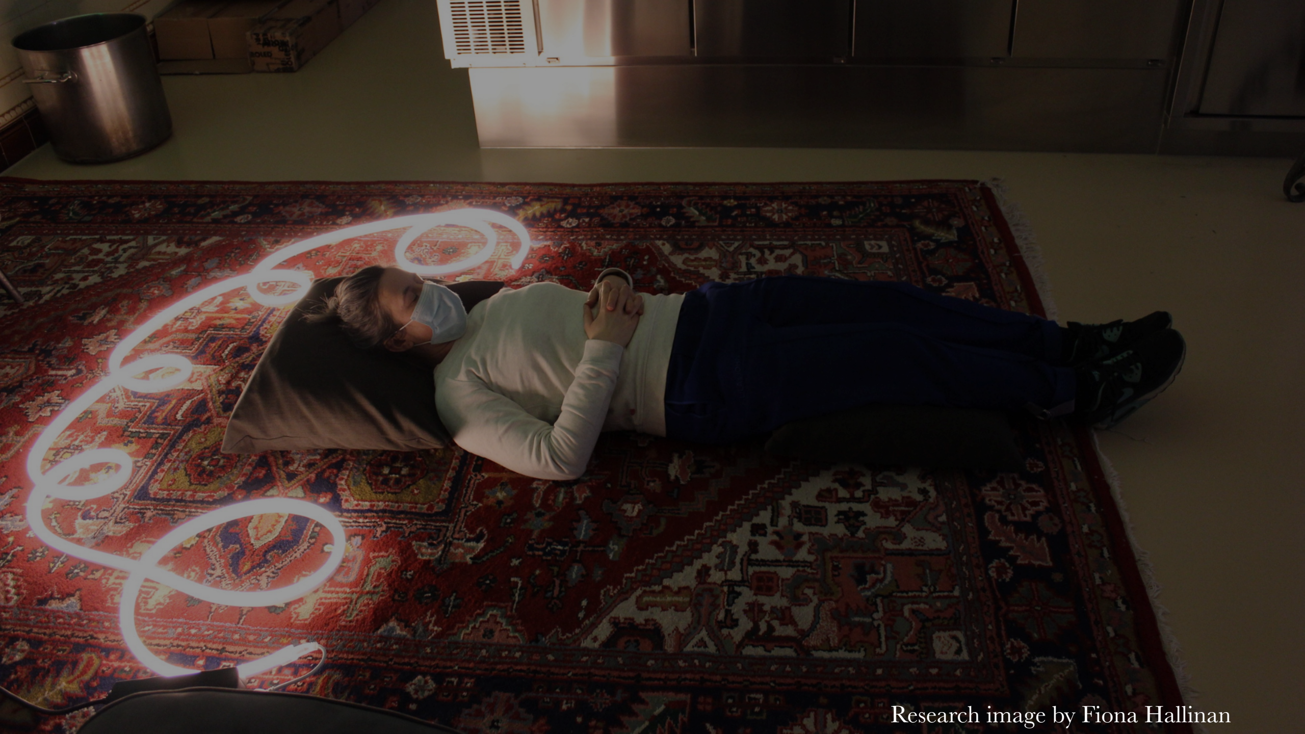
Research image by Fiona Hallinan