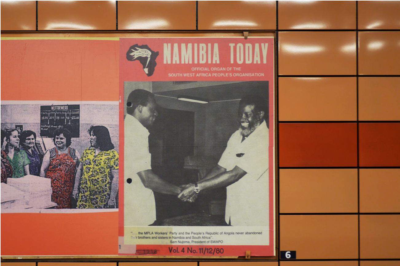
Namibia Today, Vol. 4 No. 11/12/80