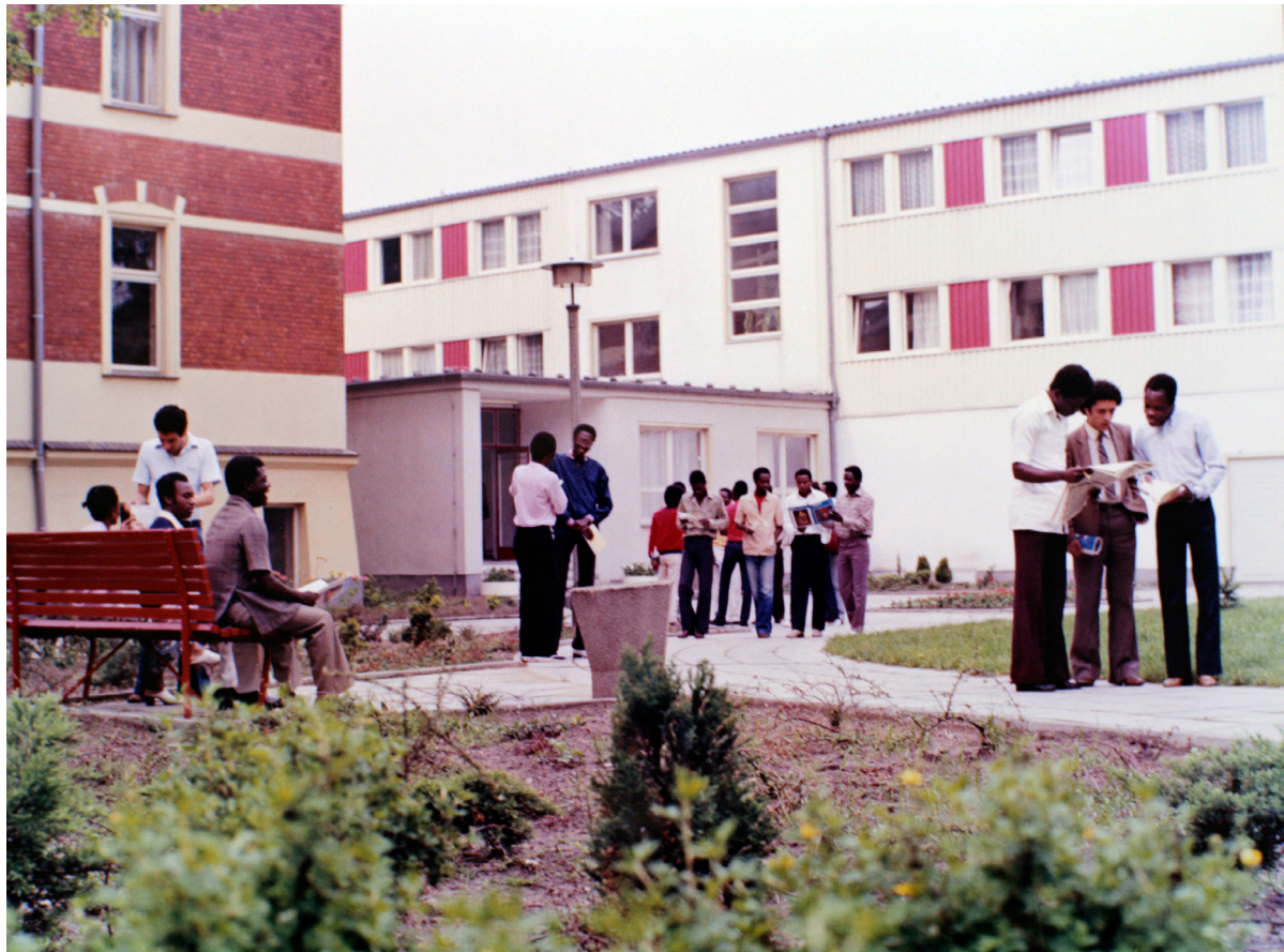
The International Institute of Journalism Berlin Werner Lambertz, Berlin-Friedrichshagen