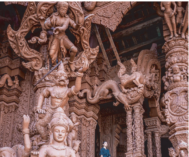
Sanctuary of truth the power of wood and incense