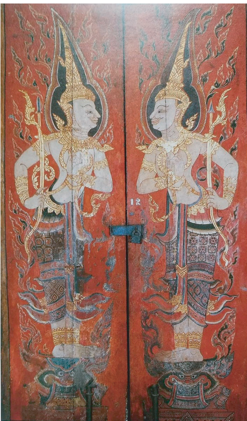
Dvarapala door guard on thai monastery gate