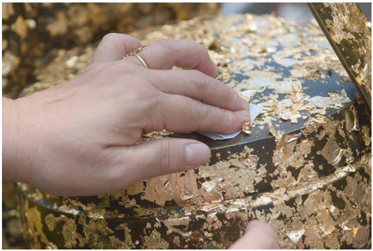
An act of contributing piece of gold