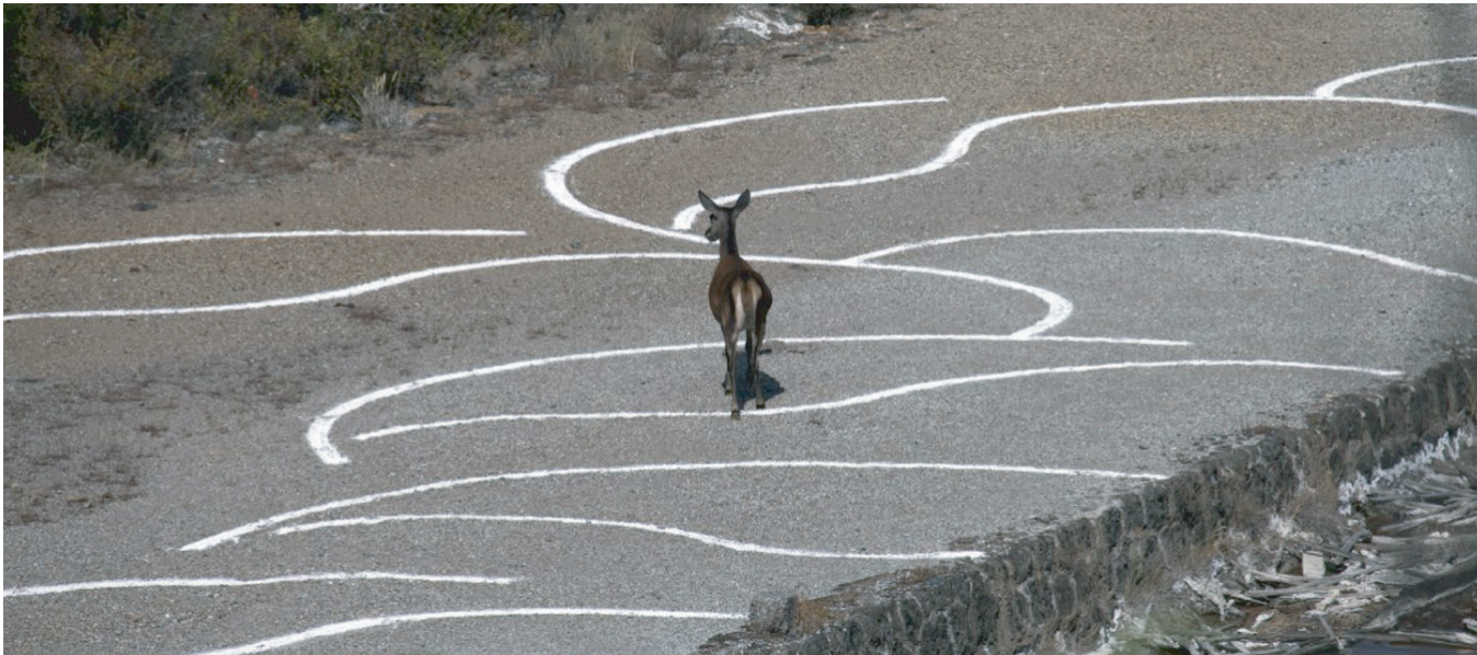
Negative Land art by Philippe Poullaouec-Ganidec

The scale of the gesture is a not a human movement. How to implement the cosmological gesture?