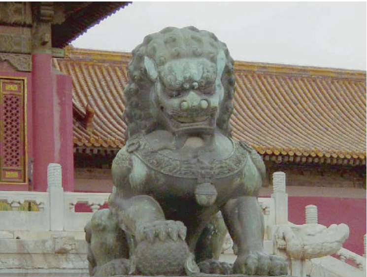
Guardian Chinese guadian lion