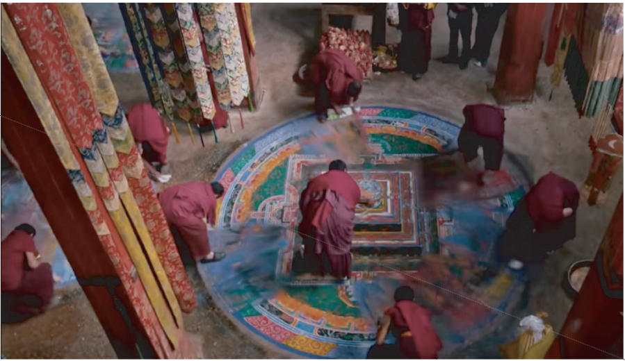
Sand Mandala Tibetan Buddhist tradition involving the Creation and Deconstruction "the universe in its ideal form"