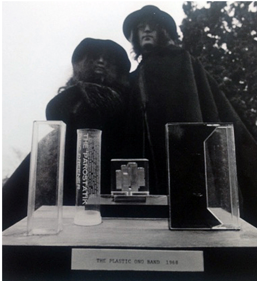
Plastic Ono Band maquette (1968) with Yoko Ono and John Lennon