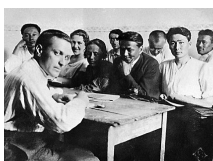
Lev Vygotsky at the university class in Tashkent, Uzbekistan, 1929.