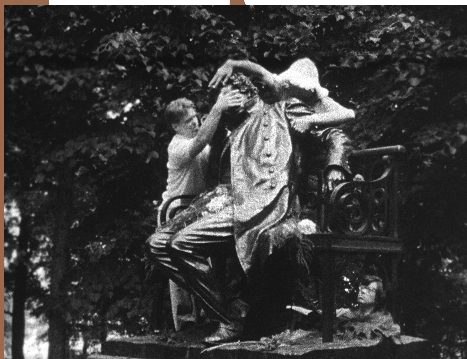
Still from Talking Hands, 2016.