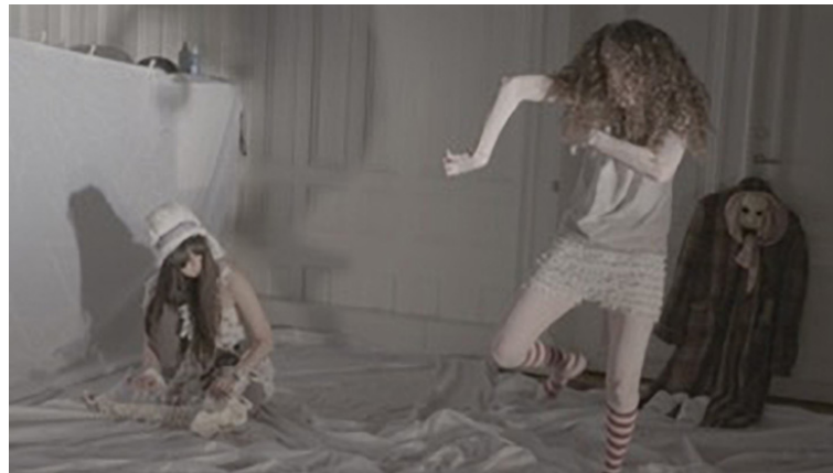
Linnégatan, Room 502: as part of whitewash , the 30% PhD Seminar.