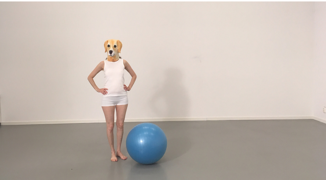
Inter-species collaborations on the set of The Shambles of Science.