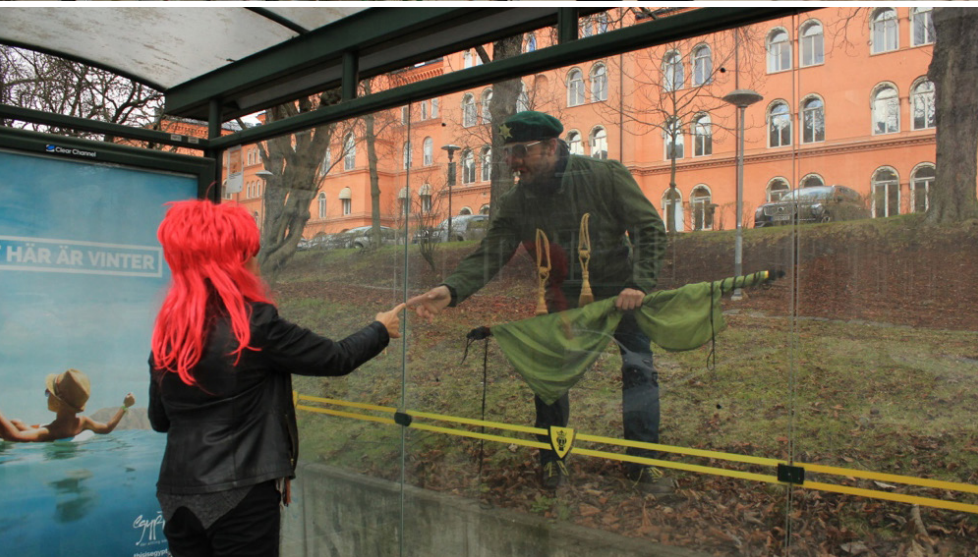
It took us a very long time to get anywhere. Everything they saw was new. They made friends along the way and played with it all.