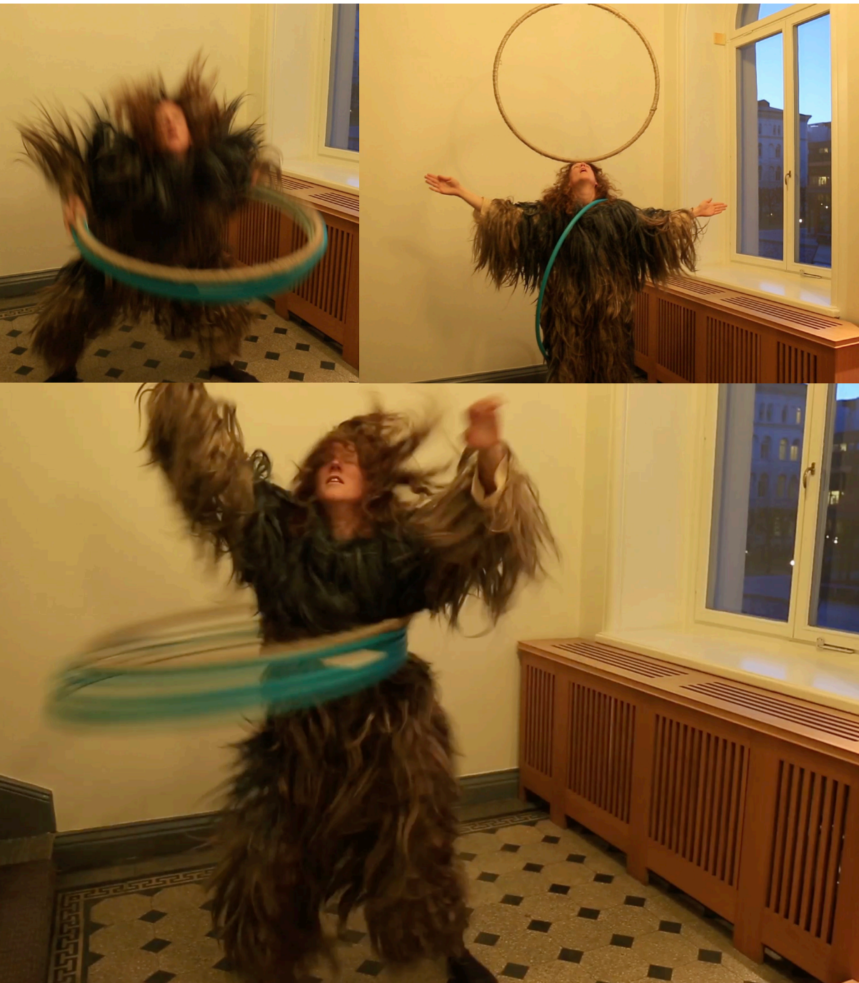
Wild thing in the hallowed halls.