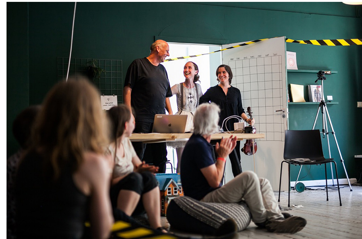
Happy and relieved performers.