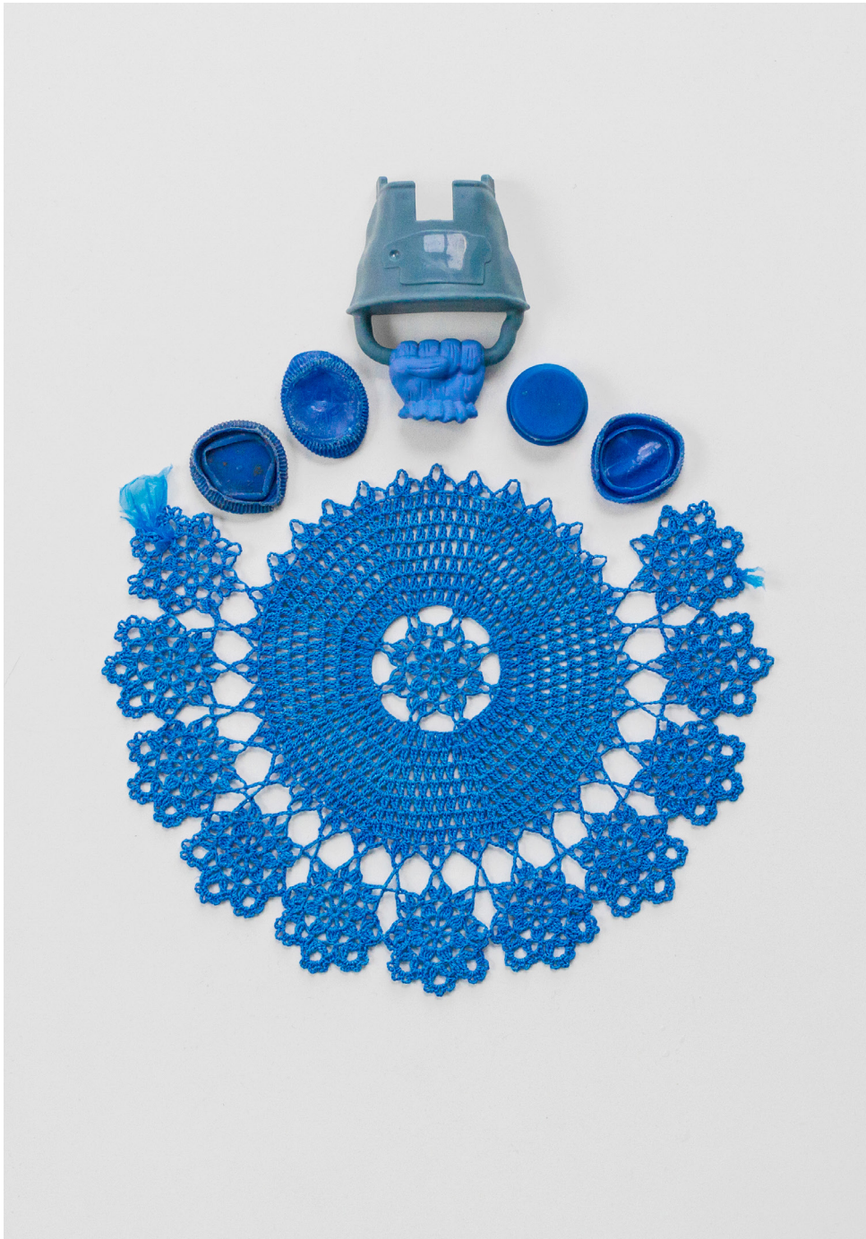
Fig. 3 Own Image, Plastic doily & found objects, 2021.