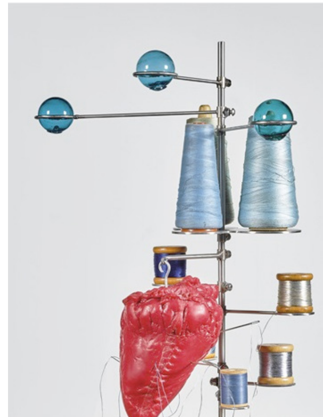
Fig. 9 Louise Bourgeois, "HEART", 2004.