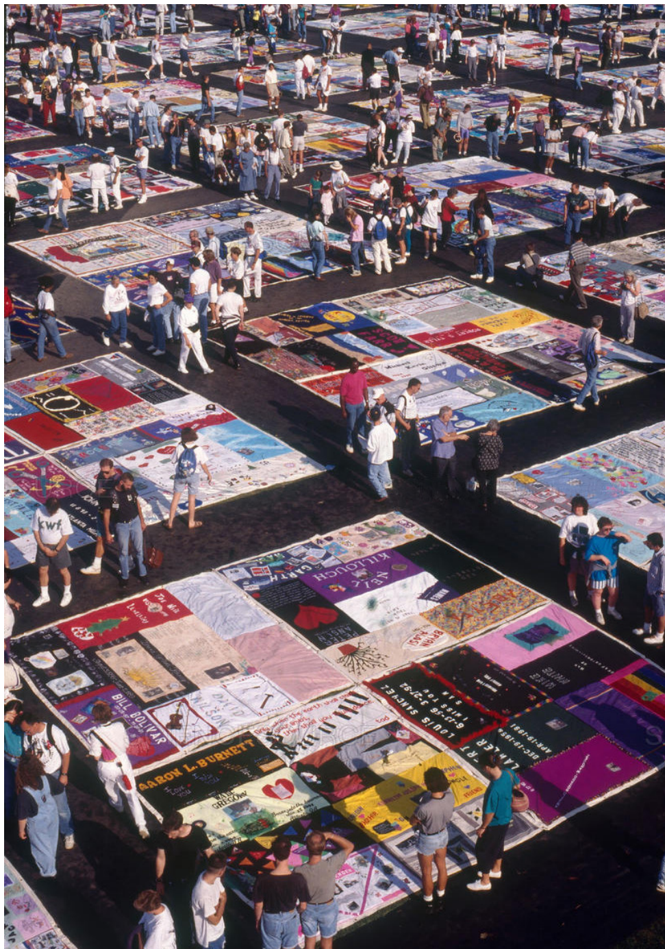
Fig. 19 Vanessa Vick, The Names Project AIDS Memorial Quilt, 1973.

The calming effect of crafting was described as deriving from the materiality of craft, and from performing the sort of activities, such as jingling knitting needles, banging the loom, cutting up one's sorrows into strips of carpet, or working in cross-stitch without any worrisome thoughts or feelings preoccupying the mind. In this way, crafting serves as an outlet for extreme and sometimes uncontrollable emotions that often arise when someone experiences personal illness, illness of a family member, friend, or death of a loved one. [28]