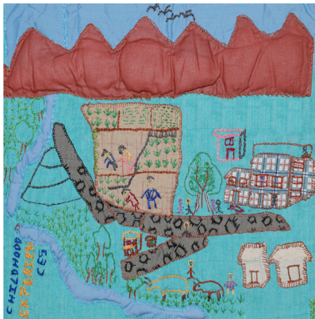
Fig. 12 Common Threads Project, "A girl is not safe in her own home", 2015.

During and following a humanitarian crisis, the rate of violence that women experience increases radically. In reaction to this, the non-profit organisation The Common Threads Project has developed a transformative trauma intervention, a therapeutic process rooted in neuro-scientific and socio-cultural understandings of trauma, using practices from trauma-informed therapy, bodywork, and psycho-education combined with the old textile traditions of sewing story cloths to depict experiences that can be impossible to express in words.