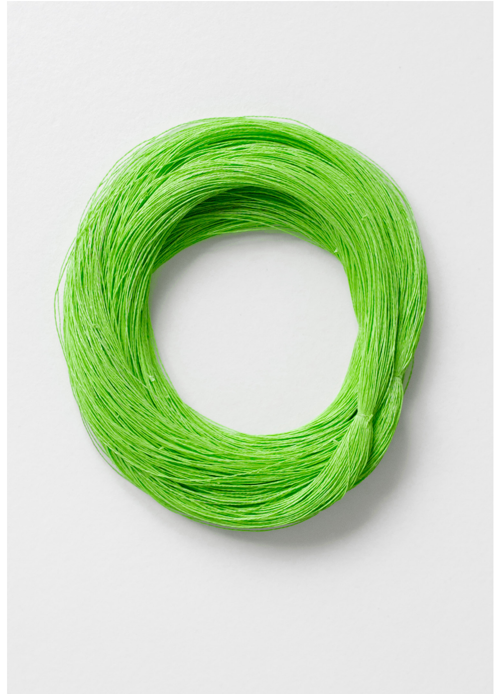
Fig. 7 Own Image, Hand spun plastic yarn, 2021.