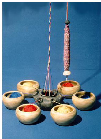
Fig. 1, House of Bavarian History, "Spindle, two spindle whorls, spouted vessel", 6th century.

Craftsmanship is thought of as the quality of work. It is embedded in the making, to do good work for its own sake. The word craftsmanship can be used in a much broader sense, not only concerning craft , but to describe the quality that gradually builds up in any kind of work done. It means that someone has taken time and effort to polish their skill in whatever they do or make. [4]