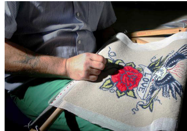
Fig. 14 Fine Cell Work, Inmate performing needlework.