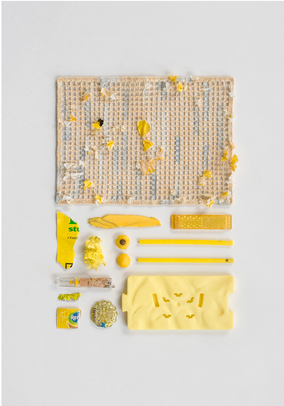
Fig. 8 Own Image, Plastic filet crochet and found objects, 2021.

In today's Western society, crafting textiles is no longer necessary to acquire everyday items and clothing. Though it is a human-based need to escape from conventional paid work and domestic chores, and for many, there seems to be a desire for embodied interaction with the material world, to make things by hand, and to form the world surrounding oneself.