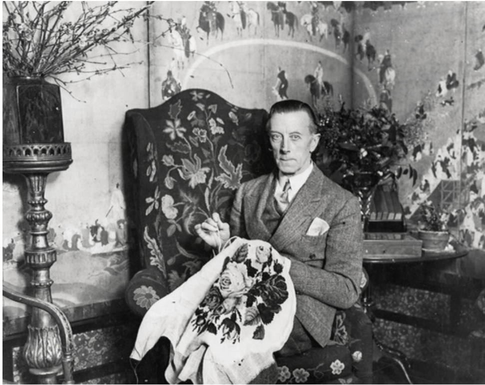
Fig. 10 Ernest Thesiger at home seated in a chair which he upholstered with his own embroidery, 1930s.