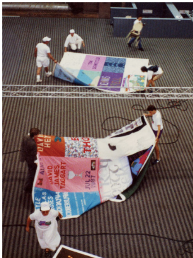
Fig. 18 The NAMES Project Foundation, Volunteers unfurl the AIDS Memorial Quilt at an event in Boston, Massachusetts.

A strikingly monumental community crafts project in the history of textile is the AIDS Memorial Quilt . The Quilt was conceived in 1985 by San Francisco gay rights activist Cleve Jones. Since the assassination of gay San Francisco's supervisor Harvey Milk and Mayor George Moscone in 1978, marches honouring these men were held annually, which Jones helped organise. During the 1985 march, he had asked his fellow activists to bring placards with the names of their loved ones who had died of AIDS. At the end of the march, they taped all of the names on the San Francisco Federal building, almost resembling a patchwork.