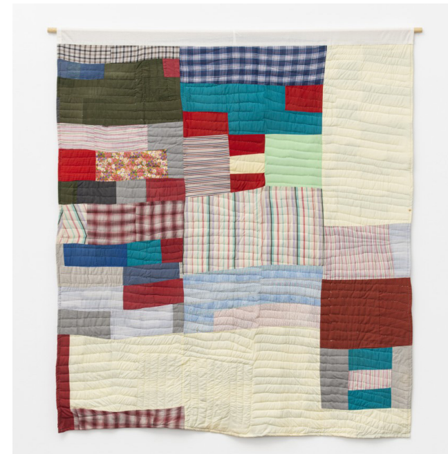
Fig. 15 Essie Bendolph Pettway, "Two sided quilt: Blocks and 'One Patch'—stacked squares and rectangle variation", 1973.

With an increase in the average ageing of the global population, activities that can be performed by individuals with reduced mobility, and with physical and mental limitations as a result of ageing are becoming more and more essential. As a result of the increase in quality of life and life expectancy in the world's population, reported cases of dementia are expected to grow threefold globally by 2050.