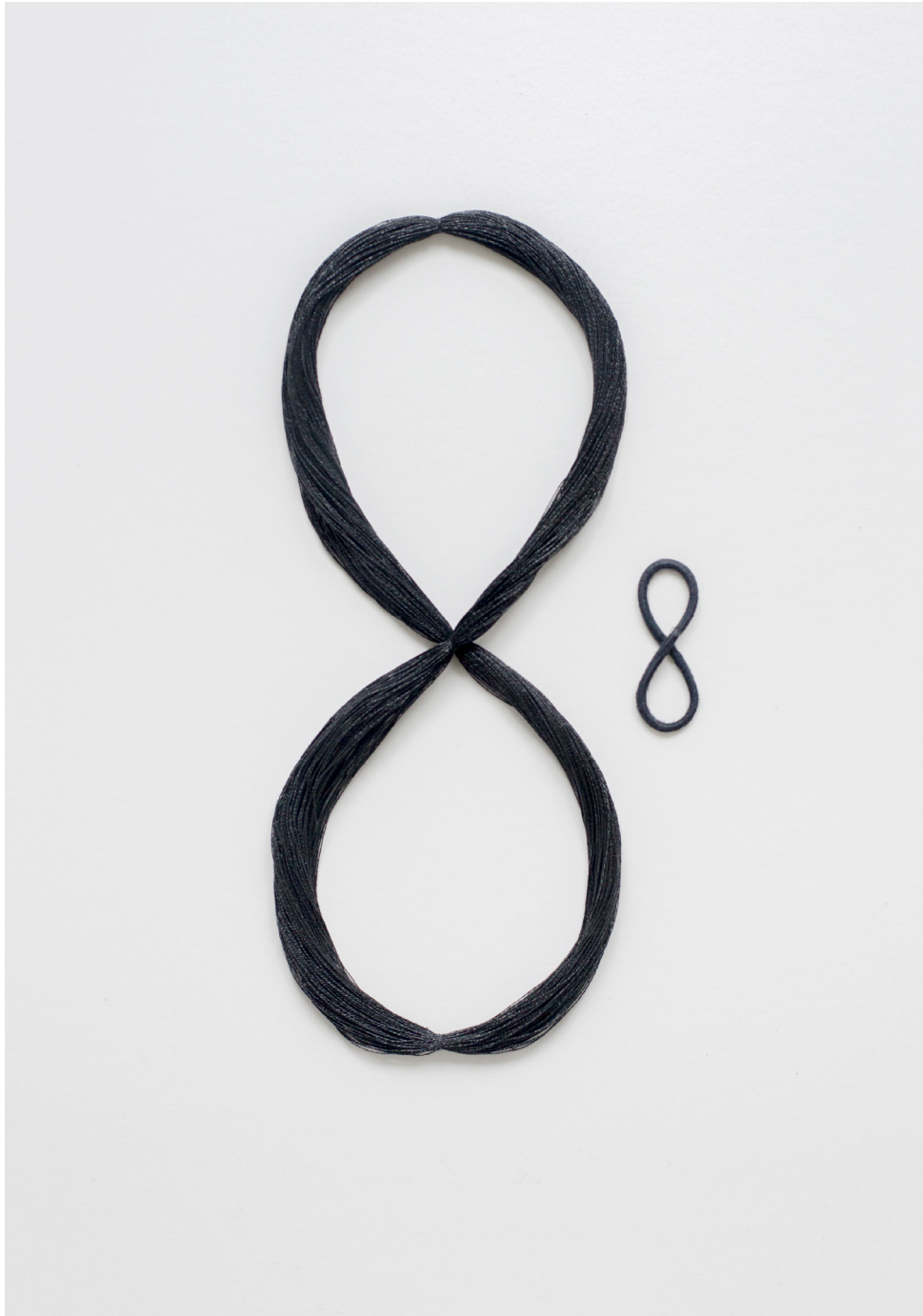
Fig. 6 Own Image, Hand spun plastic yarn & hair band, 2021.