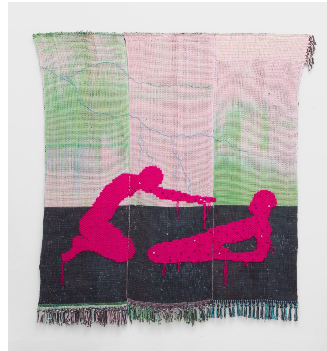
Fig. 5 Diedrick Brackens, “shape of a fever believer”, 2020.

To measure well-being or ‘happiness’, the concepts of hedonic well being and eudaemonic well-being are often used. Both schools of thought, important to philosophy and psychology, date back to Ancient Greece and are used to signify the ‘good life’ or the ultimate goal in life. [8]