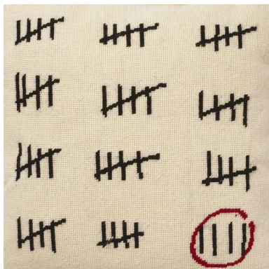
Fig. 13 Fine Cell Work, Embroidered cushion.

The charity Fine Cell Work is aimed towards inmates serving their sentences in British prisons. As prison populations continue to grow, and inmates are confined to their cells for endless hours, Fine Cell Work provides prisoners training in high-quality, skilled needlework, to foster hope, discipline, and self-esteem.