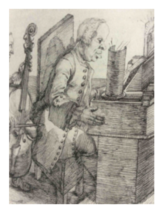
Fig. 8. Nicola Logroscino leading his own opera (1753)

It is important to emphasize that the musical scene was organized at that time in a completely different way than today's classical music scene. As we noticed with Lully's case, the seventeenth century was notably characterized by the active participation of the composer during the performances, being most of the time in charge of the execution of the music. There is in fact no different in the eighteenth century. An anecdote recounted by Charles Burney in one of his trip to Italy describes the composers authority in performance : attending a performance of a mass in Bologna for