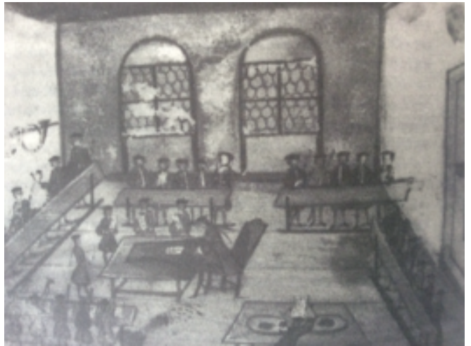
Fig. 11. Jena collegium musicum, c.1740

because, as he said : « as regards performance, a Kapellmeister should, next to singing, also be able to play the clavier, and in fact quite well, because in performance he can best accompany all the others and direct at the same time.»<sup>72</sup>. Indeed, 18<sup>th</sup> century leaders preferred to lead