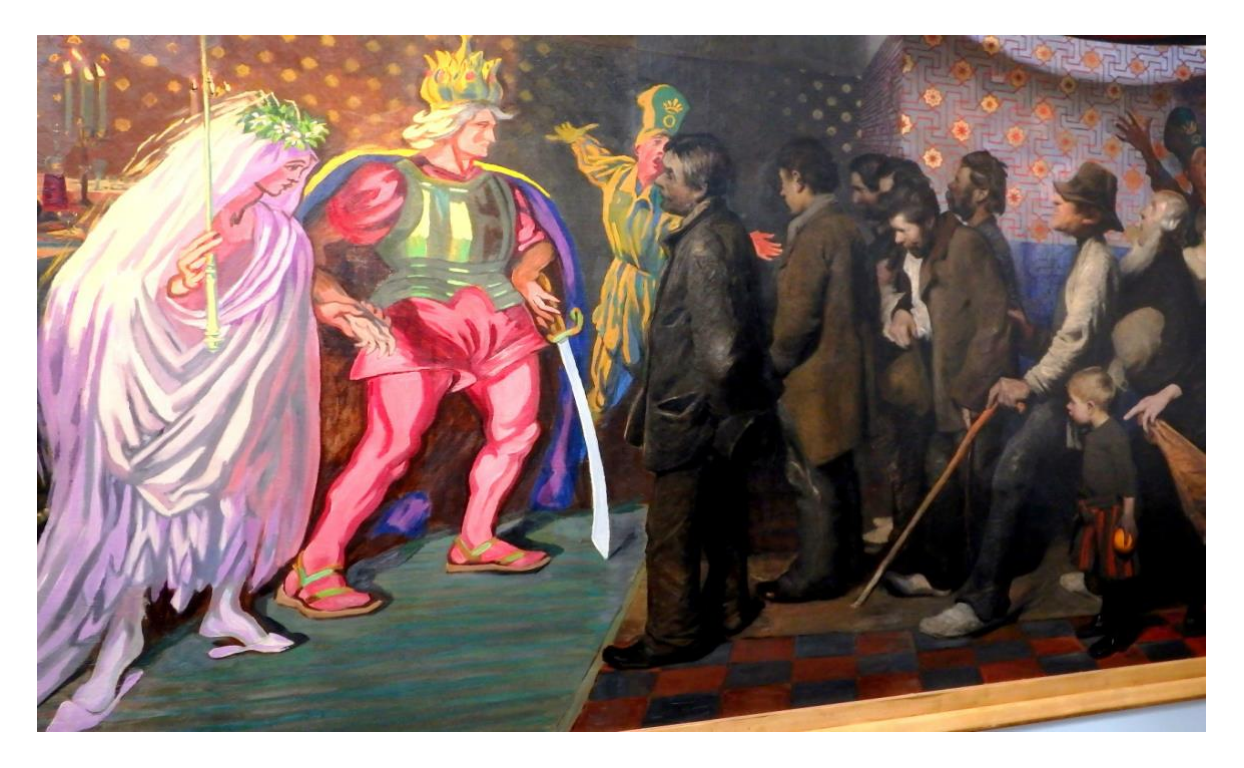
"The Wedding of the King's Son" (a section of the painting), by J. K. Willumsen, 1888 and 1949

And children's TV. specially those who combine, and those who are to combine different ugly and good taste images, like for example it is the case in " The Wedding of the King's Son ".