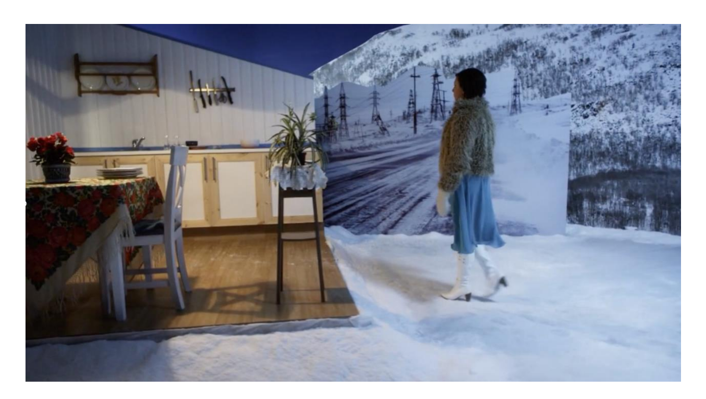
Frame grab from video installation, "Border Musical" by Olga Tsaplya, 2013

To not let Verfremdung be the only reference though, I will need to gather examples from more films, visual art pieces and theatre, and different parts of them, to define the film genre I am inspired from and the one I wish to work in myself, but the use of Verfremdung is important as something overall, as a comment to what we do when we construct reality the way we do in fiction today.