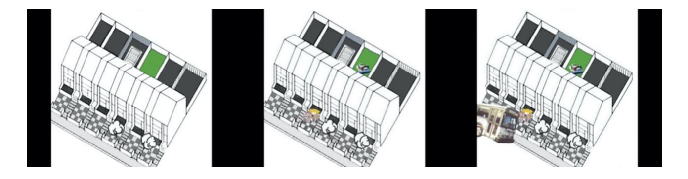
Frame grab from an animated drawing, made right before entering the Film School

My film school expectations were different from (more naive than) the reality I met there. I thought that I could simply add some knowledge to my visual expression from the arts, but realized that visual art was not an integrated part of making films.