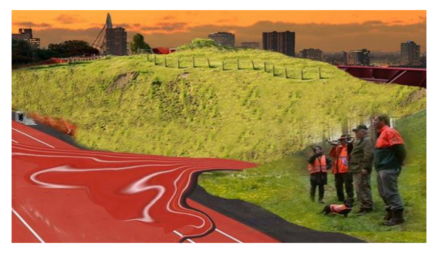
Frame grab from Ulu Brauns video installation, "The Park", 2011

How does this artistic practice meet the film production and the audience in another way than usual?