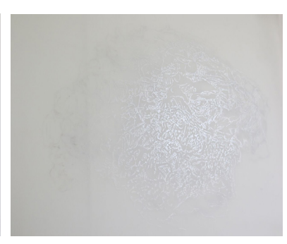
Echo Silver ink on drafting film

The Echo drawings were made through collaboration with a theoretical cosmologist and an anthropologist of science. Together we worked to develop drawings reflecting a condition of imperceptibility as encountered in theoretical cosmology, specifically, articulating a state of indeterminacy as witnessed in quantum world. How might drawing, as a typically intimate technology, might explore absolute and distant limits of human 'sensing'. 'Echo' refers to probing technologies sent out into space which relay back images and data.