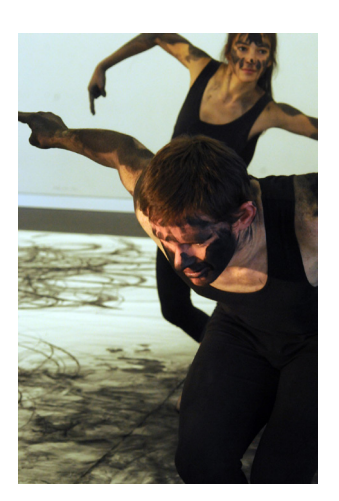
Impressibility Film projection

This project invited young emerging artists with physical or intellectual disabilities to produce new and innovative artworks under the mentorship of three artists in residence with the Youth Arts Warehouse and Regional Youth Support Services, Gosford, NSW, Australia. In this work, three dancers from NAISDA created a movement around the notion of mental illness on large sheets of paper covered in graphite and charcoal powder. Taking an approach towards drawing that is open-minded, unknowing and inquiring, three young visual artists responded through tracing the movements of the dancers creating a visual dialogue where gestural lines and remnants of individual's actions of mark making show the varied marks from linear board sweeping lines to whole handprints imprinted into graphite and charcoal powder. The lines embody the relationship between the individual's movement and lived experiences that become a site for the unconscious and unconscious to encounter where drawing begins to draws itself.