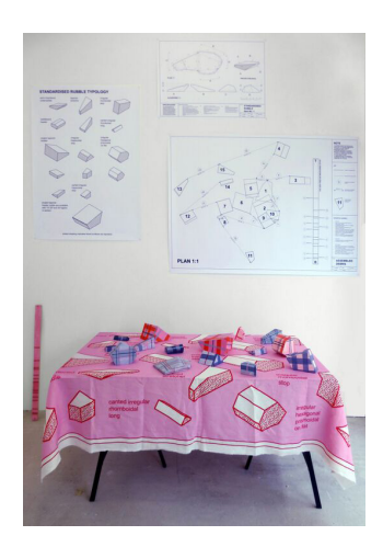
Standardised Versions (Rubble) Architectural drawings/plans, patterned paper nets, digital print on fabric, trestles and plywood table

Standardised Versions (Rubble) takes as its starting point the idea that representations of scenes of disaster are based on standard types. What if these scenes were all deliberately and carefully placed to give the appearance that they had been assembled in an apparently random manner? Standardised Versions (Rubble) consists of a typology of elements: architectural drawings/plans/specifications on paper and cloth, 3D sculptural rubble elements and technical equipment in the form of the very precise measuring stick (VPM®). Standardised Versions (Rubble) is a collaborative work though which Fisher and Stratford are engaged in a conversation around examining how representations of disaster and destruction are mediated for our consumption. During the exhibition, the standardised rubble (paper objects) items will be assembled on-site in front of the drawings (using the plans and precise measuring stick (VPM®) in a 'Live Demonstration'. After the live demonstration the objects will be re-staged so that the performance can take place all over again, facilitating a discussion around collaborative practice as research process. Ultimately, through collaborative imaging and installation the work draws on Stratford's background in architecture/live art to subvert the language of architectural conventions/roles, and Fisher's background in installation/textiles/craft to play with and reconstruct that which has the appearance of having been deconstructed.