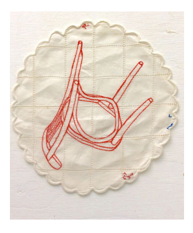
Casper N. Red ink and thread on cotton doily, oak framed

Casper N. is a drawing of an upturned Thonet No.14 chair drawn in red ink onto a cotton doily and sewn over with red cotton yarn. Thousands of these chairs exist from their origins in Austria in 1859 through to Muji or Ikea today, they exemplify a post-industrial aesthetic and are commonly found in theatrical rehearsal studios where their relative light construction, uniformity and graceful lightness make them ideal extensions of the actor's presence. Caspar Neher went beyond the provision of the Scenographic. 'Bühnenbild' — simply to visualise stage action, he extended presence through objects. "The war separated / Me, the writer of plays, from my friend the stage designer. / The cities where we worked are no longer there. / When I walk through the cities that still are / At times I say: that blue piece of washing / My friend would have placed it better." The Friends, Bertolt Brecht. JERWOOD_CATALOGUE_5_52385bc5c7fe4.pdf