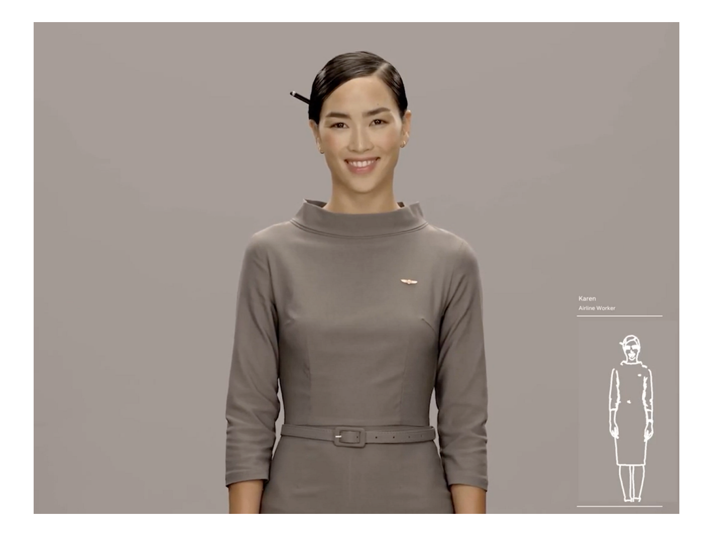
FIGURE 2-3. "KAREN," STAR LAB'S NEON <sup>5</sup>