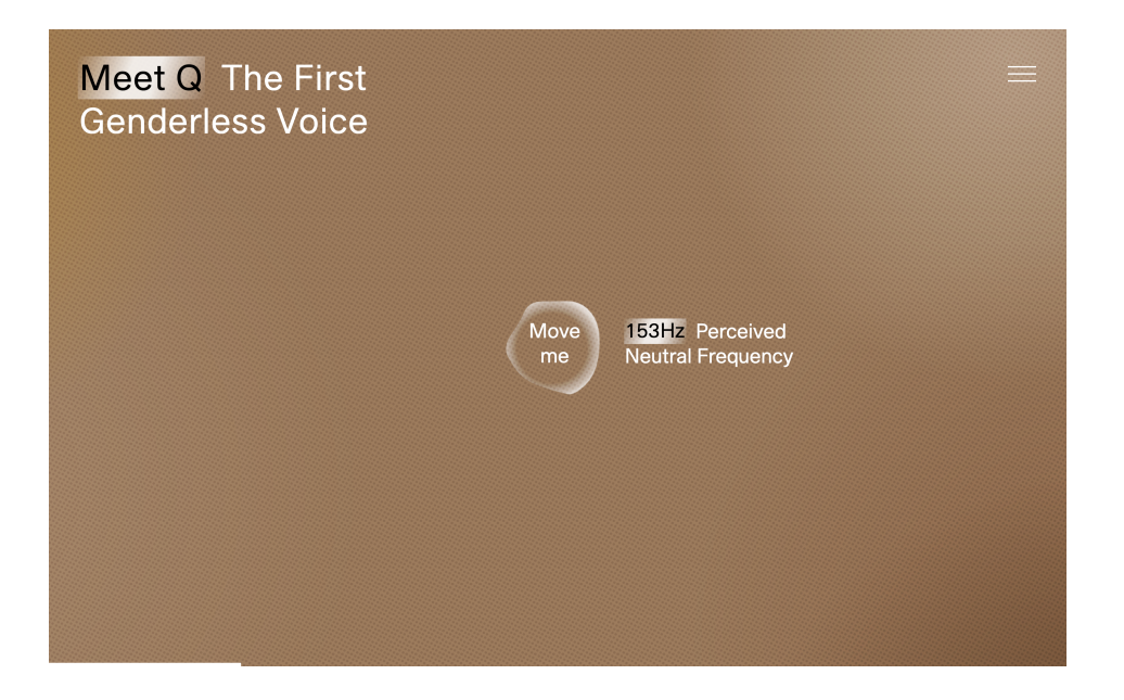
FIGURE 3-1. ONLINE DEMONSTRATION ON THE Q WEBSITE

A recent collaboration between Copenhagen Pride, Virtue, Equal AI, Koalition Interactive and thirtysoundsgood resulted in a digital voice prototype called Q. The landing page of their website<sup>6</sup> guides the user to drag 'Q' between the "perceived female frequency" and the "perceived male frequency." When the user releases the mouse, Q returns to the center of the screen to the "perceived neutral frequency," or 153 hertz. (See Fig. 3-1)