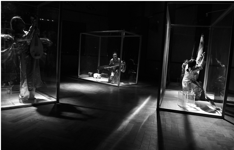
Fig. 9 Image from Inside/Outside at the Chèo theatre, Vietnam 2012.

A contrasting use of costume is found in Inside/Outside . In Vietnamese TV shows, the áo dài has always been a symbol of tradition. But the way the áo dài is presented here, the traditional origin of the dress, as well as of the music, is complemented with other visual, choreographic and musical components, “improving” the historical dress to give it a sense of contemporaneity. A similar observation is made by Salemink (2007), in a further discussion of the fashion shows at the Huế Festival , arguing that the models represent an aesthetic image of modernity, albeit in Vietnamese style, and constitute a reason for pride in the physical shape of the female half of the country’s population. The quintessential female embodiment symbolising the nation is clothed in the áo dài , and this gendered and embodied vision of the nation is considered attractive because it is simultaneously modern and uniquely Vietnamese. Clearly, the Eyes of the Moon fashion show hosted by the Huế Festival was contextualised by an aesthetic politics that featured women’s bodies in a quasi-traditional national dress, and this partly explains the popularity of the fashion show in comparison with other artistic performances at the Huế Festival (Salemink, 2007, p. 568).