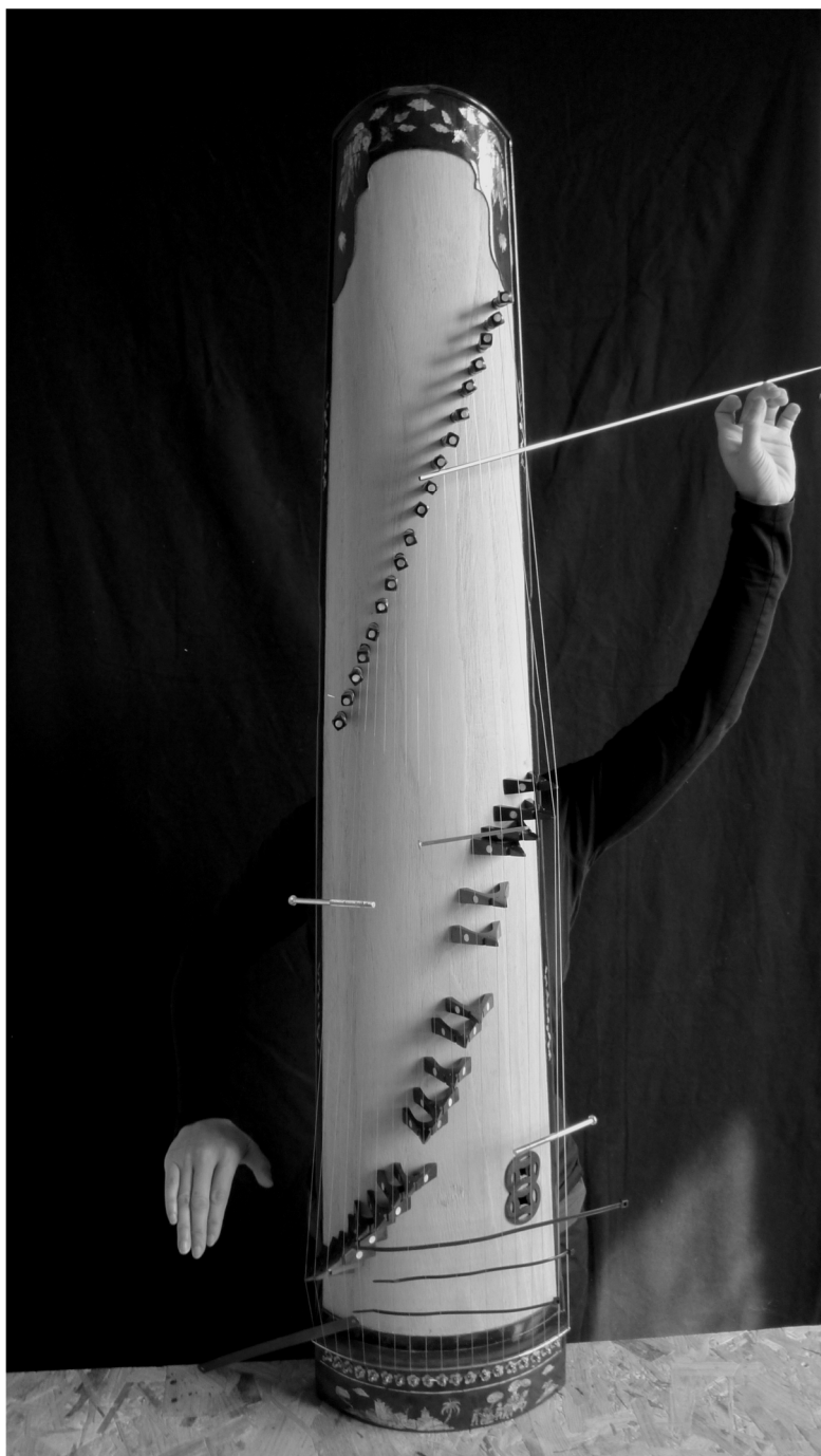
Fig. 16 The Vodou-dàn tranh.