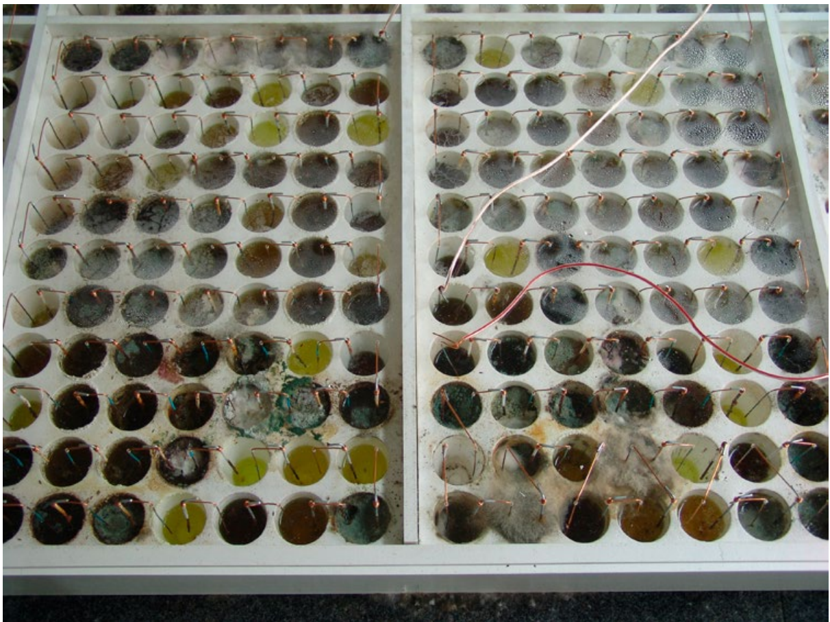
Just a month later