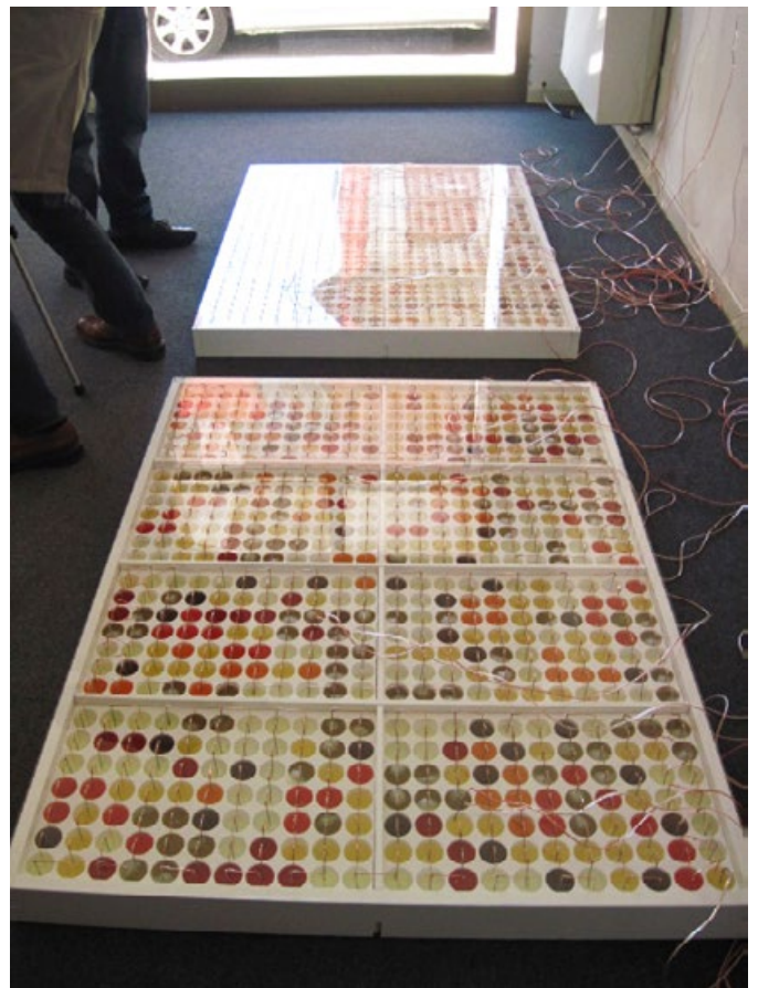
W.E.L.T.O.K Light , Voltaic pile based on lemon juice, orange, red orange, kiwi, tomatoes, coffee and salt water, led letters, variable size, 2012