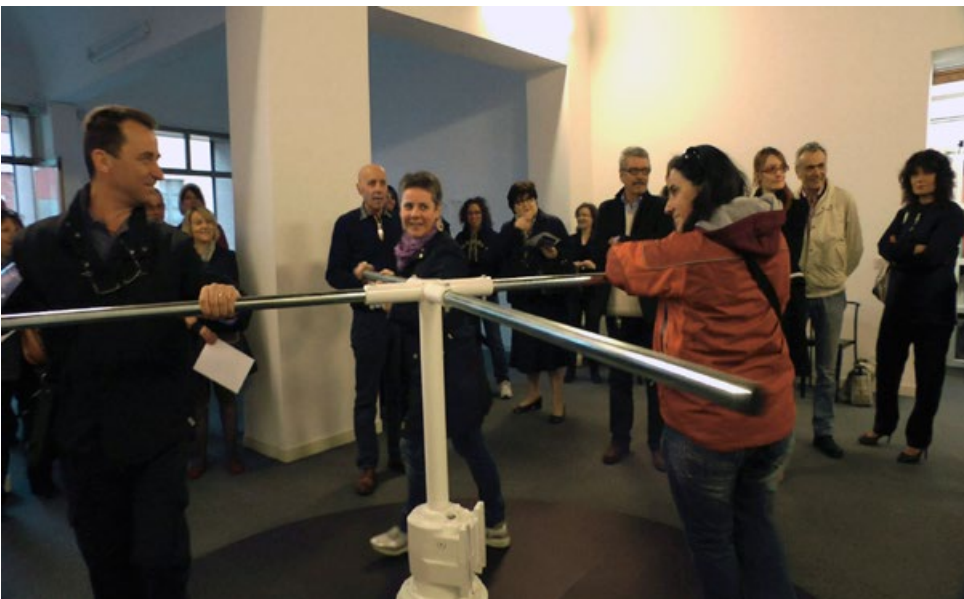
Enjoy your life , iron, alternator, mechanical reduction unit, charge controllers, batteries, relay, inverter, double video, ø 300cm - h 115 cm, 2012