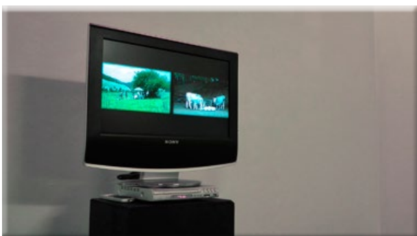
LINK: les déjeuner sur l'herbe #1 LINK: les déjeuner sur l'herbe #2