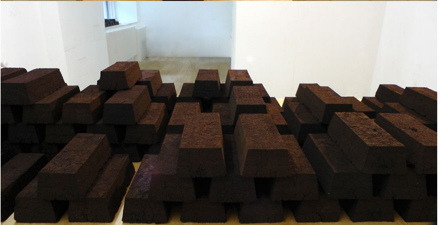
YOU ARE NOT A SALMON - Kaffeesatz , 100 ingots made of coffee grounds, 2012