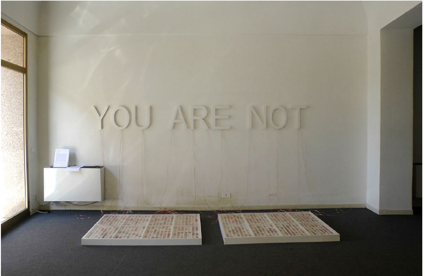
Photo Opening YOU ARE NOT A SALMON - Massimo Pianese Solo Show c/o Placentia Arte Gallery - Piacenza Italy - 21 April / 21 May 2012