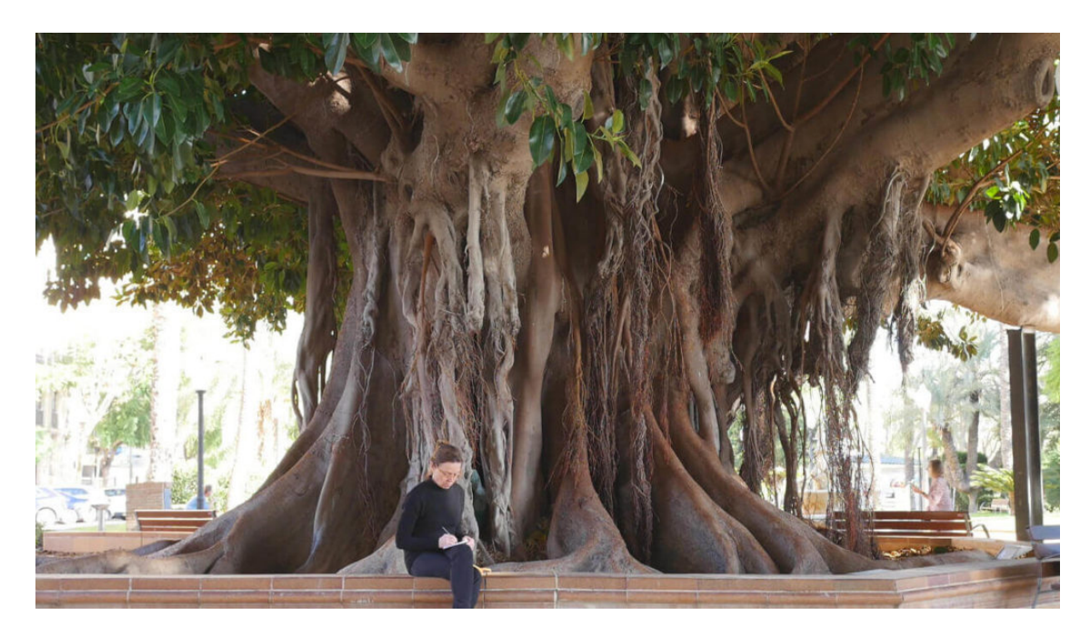
Australian Banyan tree in Alicante.

and some more recent reflections added as a voice-over narration. The original videos are available online on the RC (see <u>original videos</u>). The video with the narration made for CARPA 7 can be watched on vimeo (see <u>Dear</u> Ficus Macrophylla Carpa 7).