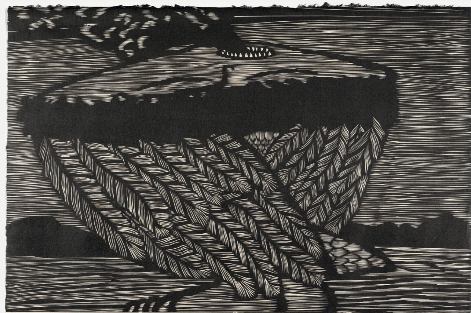
cloud page 10