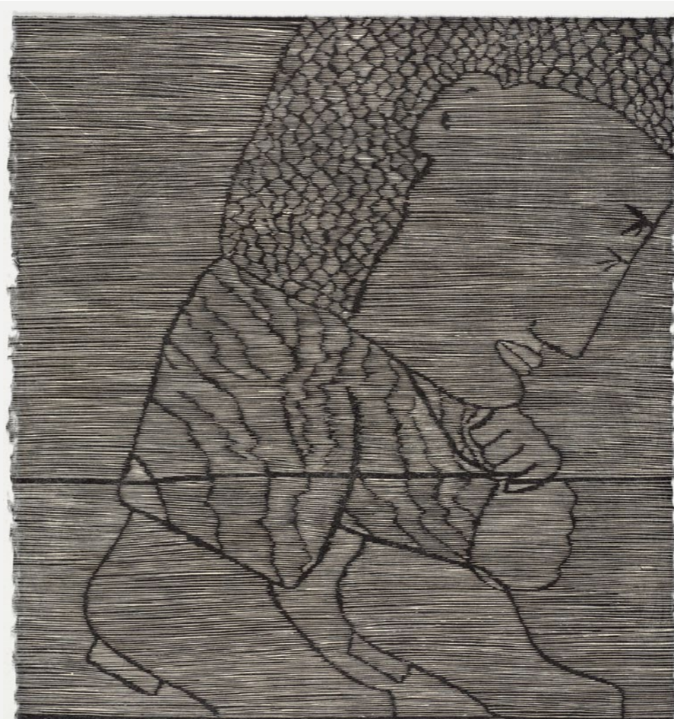
1/6 tiny secret