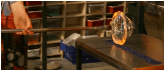
Figure 2: Adding a ribbon with structure around the surface of the bowl