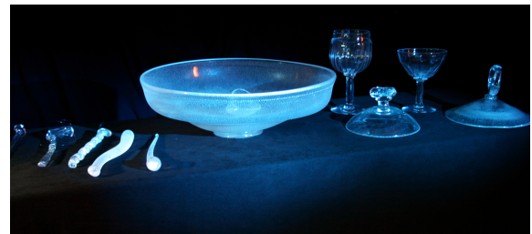
Figure 1: Examples of glass instruments and tools, from left: rods, bowl and shapes with a stem.

So far we have been developing three different types of shapes: bowls, shapes with a stem (i.e. ‘wine glass’), and rods (see Figure 1). For each of these types, various construction techniques and surfaces have been explored. The following sections will present these in more detail.