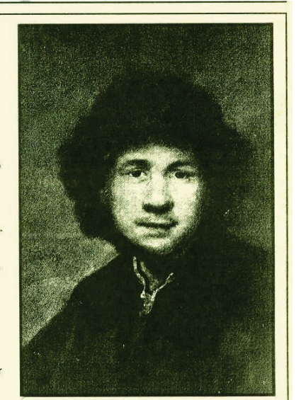
Zelfportret van de jonge Rembrandt.