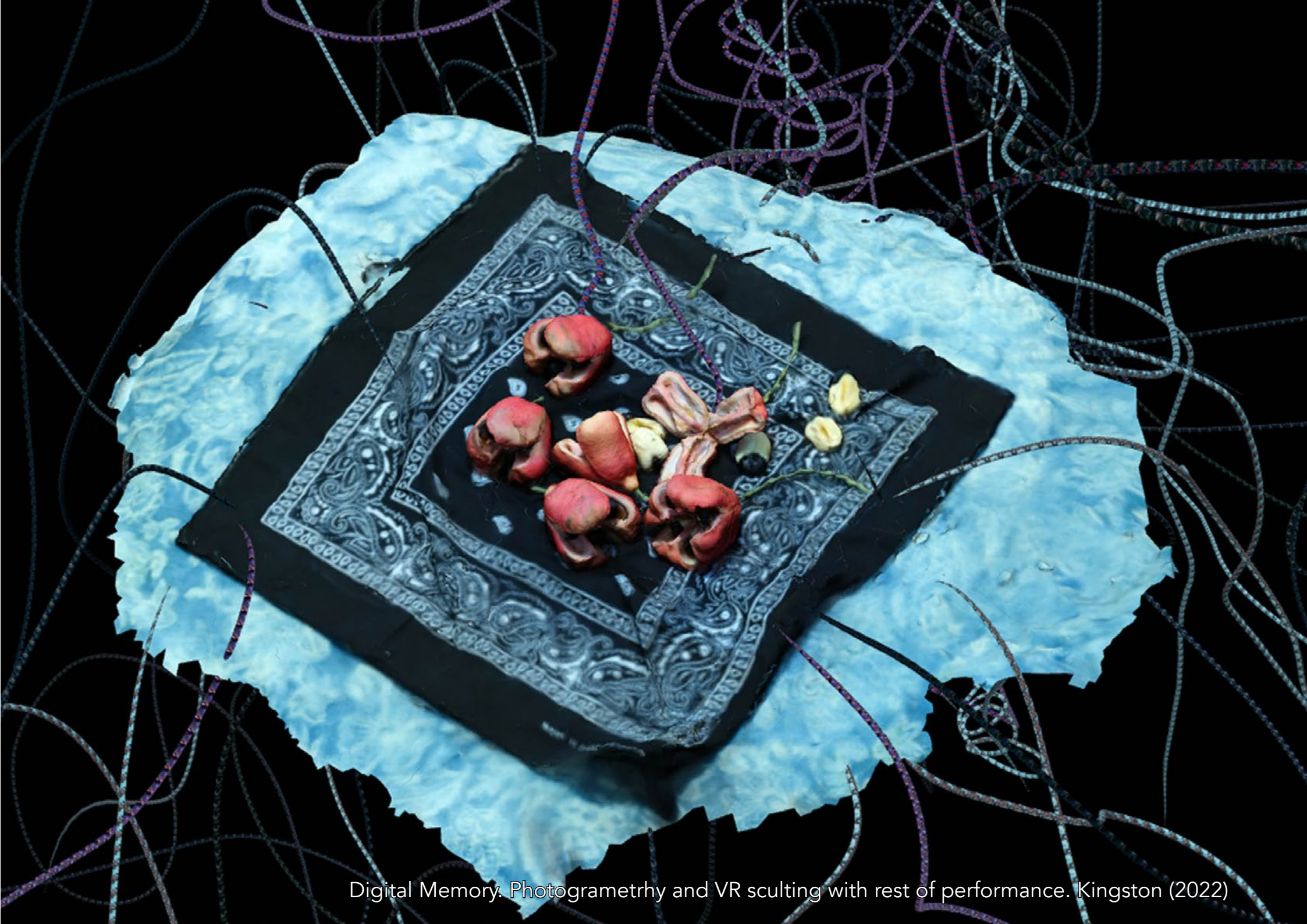
Digital Memory. Photogrametry and VR sculping with rest of performance. Kingston (2022)