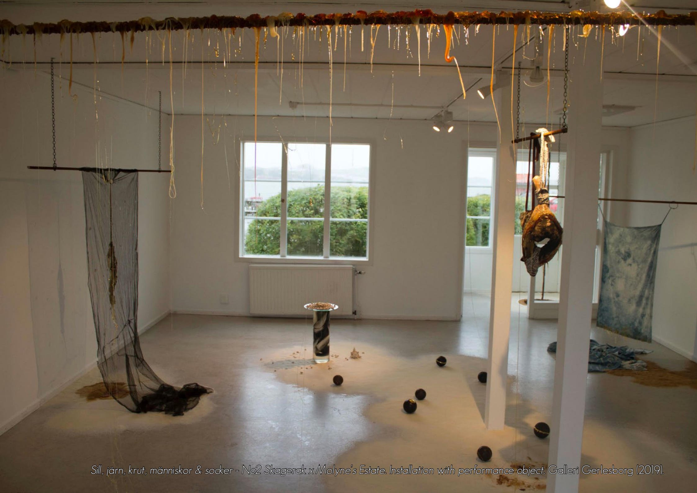
Sill, järn, krut, människor & socker - No2 Skagerak x Molyne's Estate. Installation with performance object. Galleri Gerlesborg (2019).