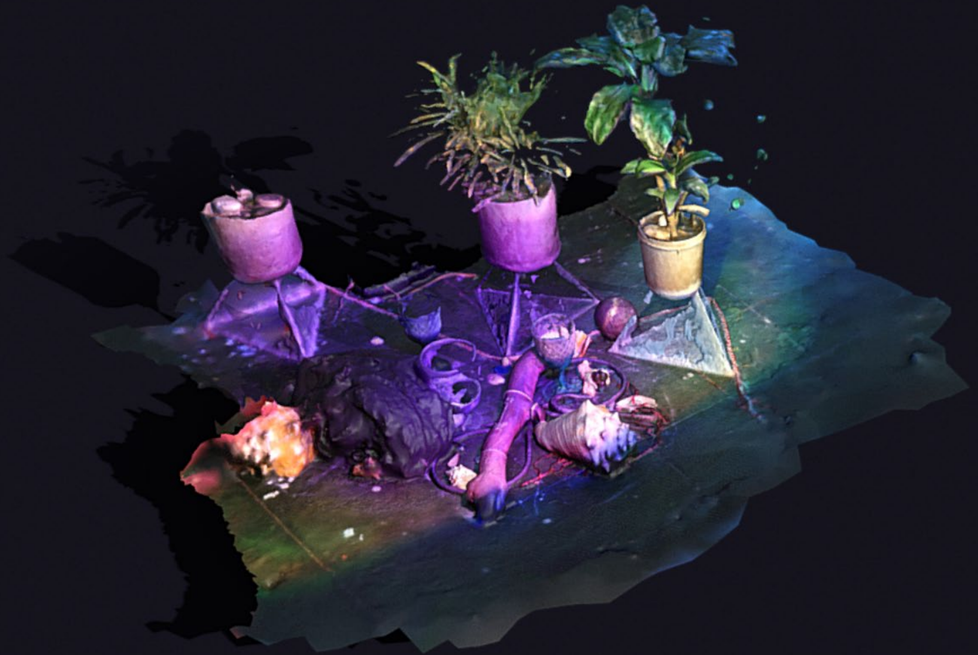
Digital memory. Photogrametry with rest of performance. Kingston (2022)