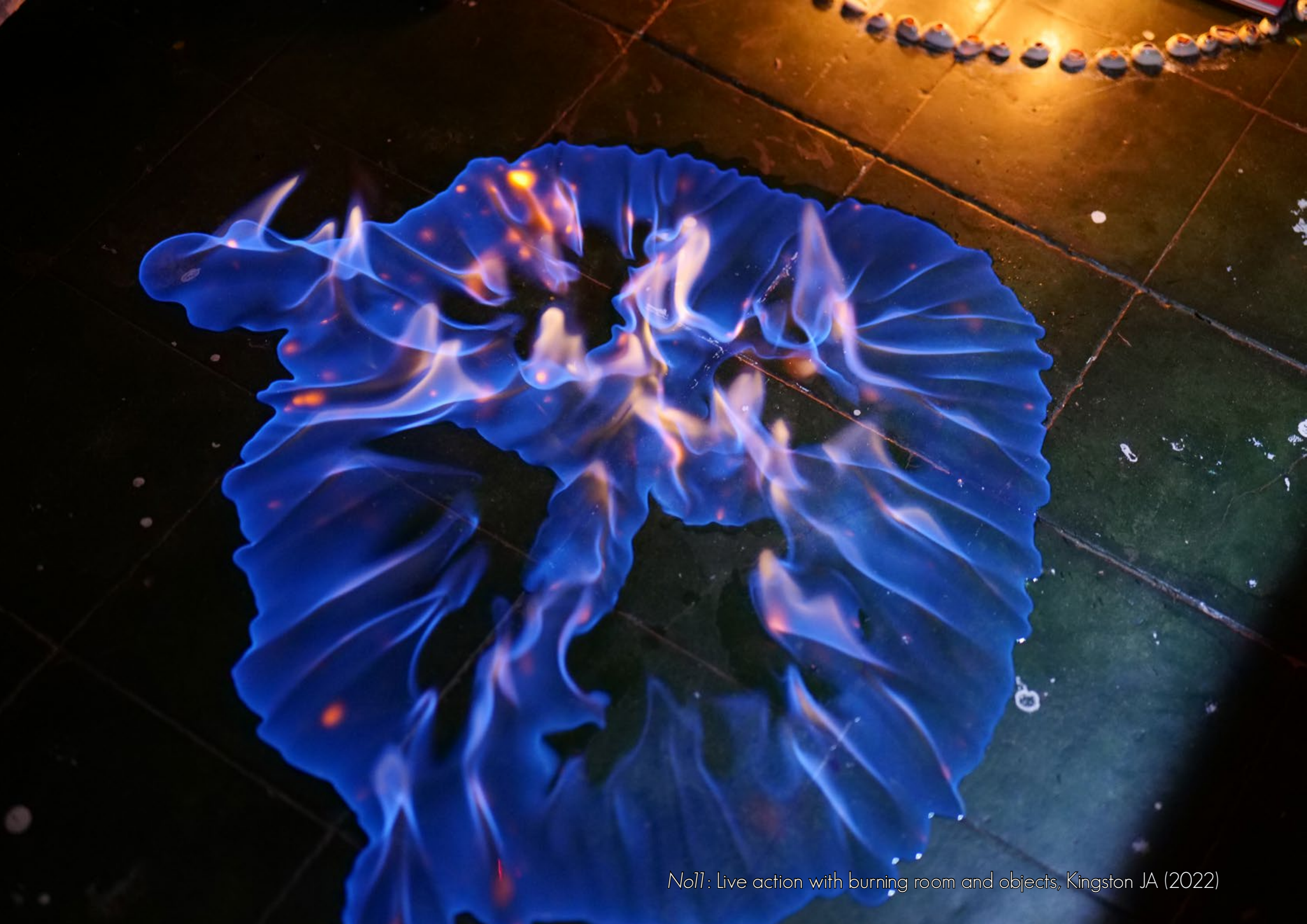
No11: Live action with burning room and objects, Kingston JA (2022)