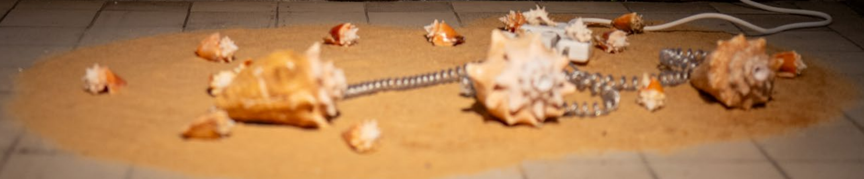
Historical Spiritual Vibrations- A space Traveling Program for Healing, Konsthall C (2024)