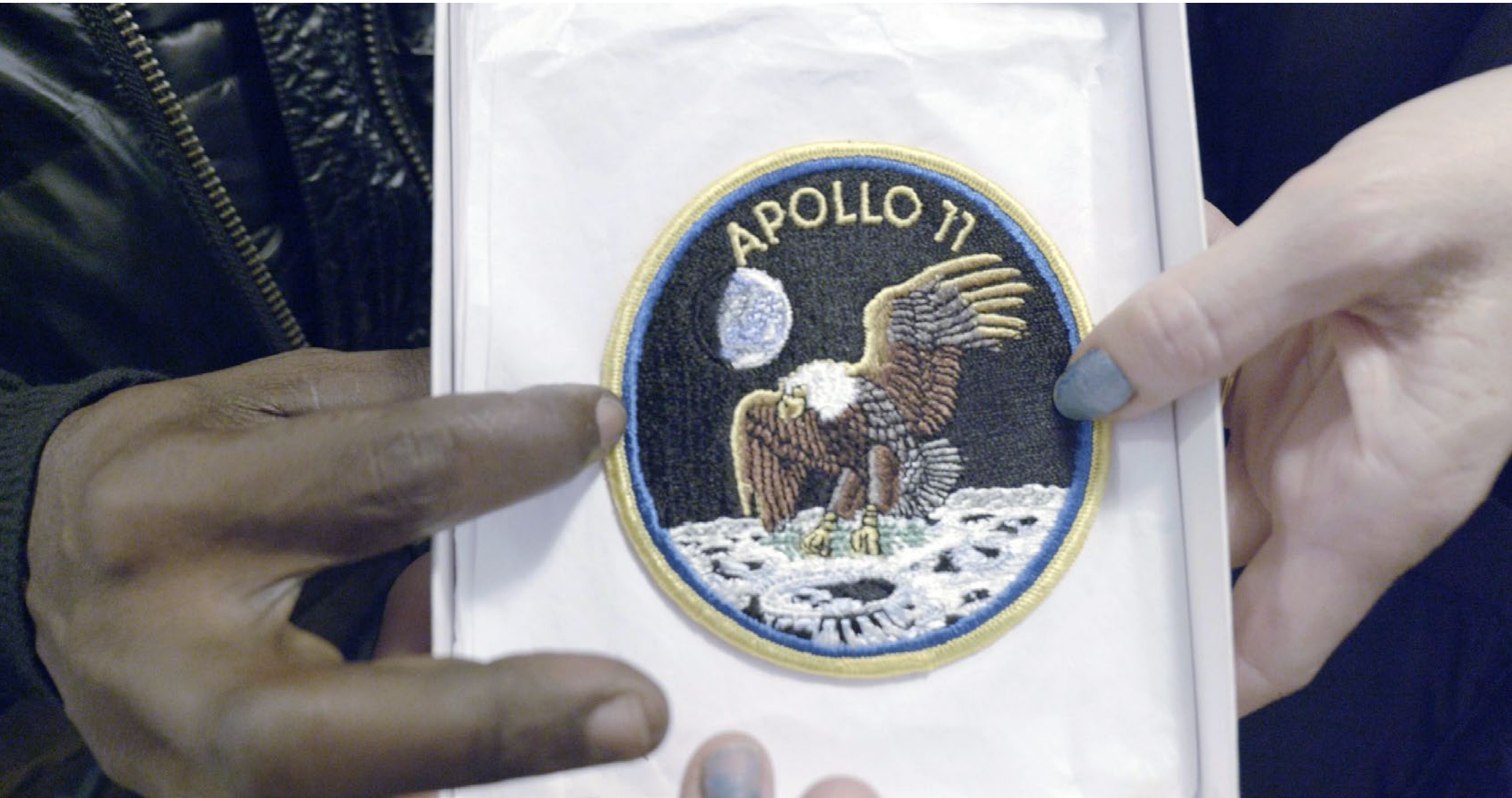
Whyte&Zettergren holding Neil Armstrong Apollo 11 Mission Patch at The Exploration Museum, Húsavík (2022)