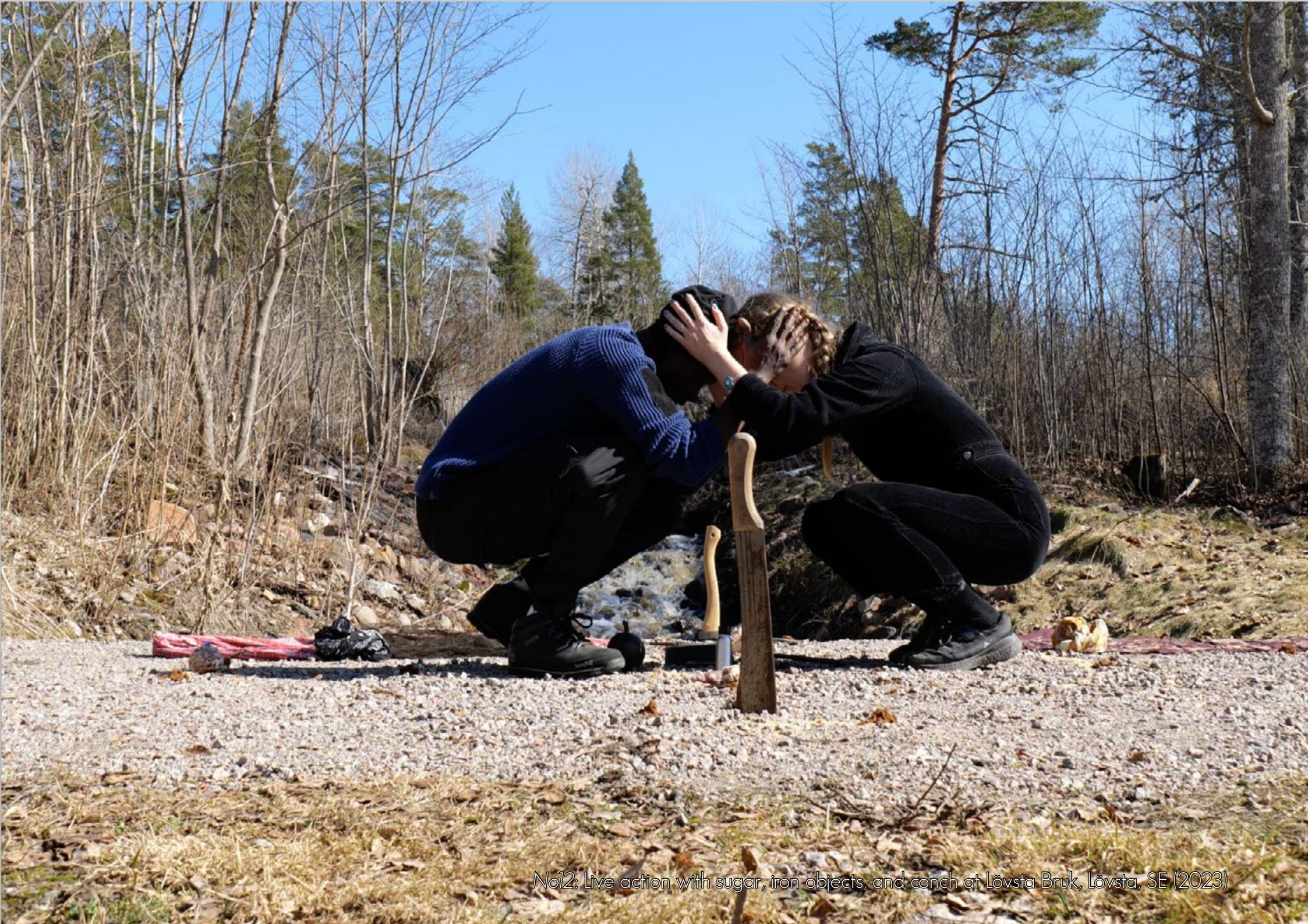
No12: Live action with sugar, iron objects, and conch at Lövsta Bruk, Lövsta, SE (2023)