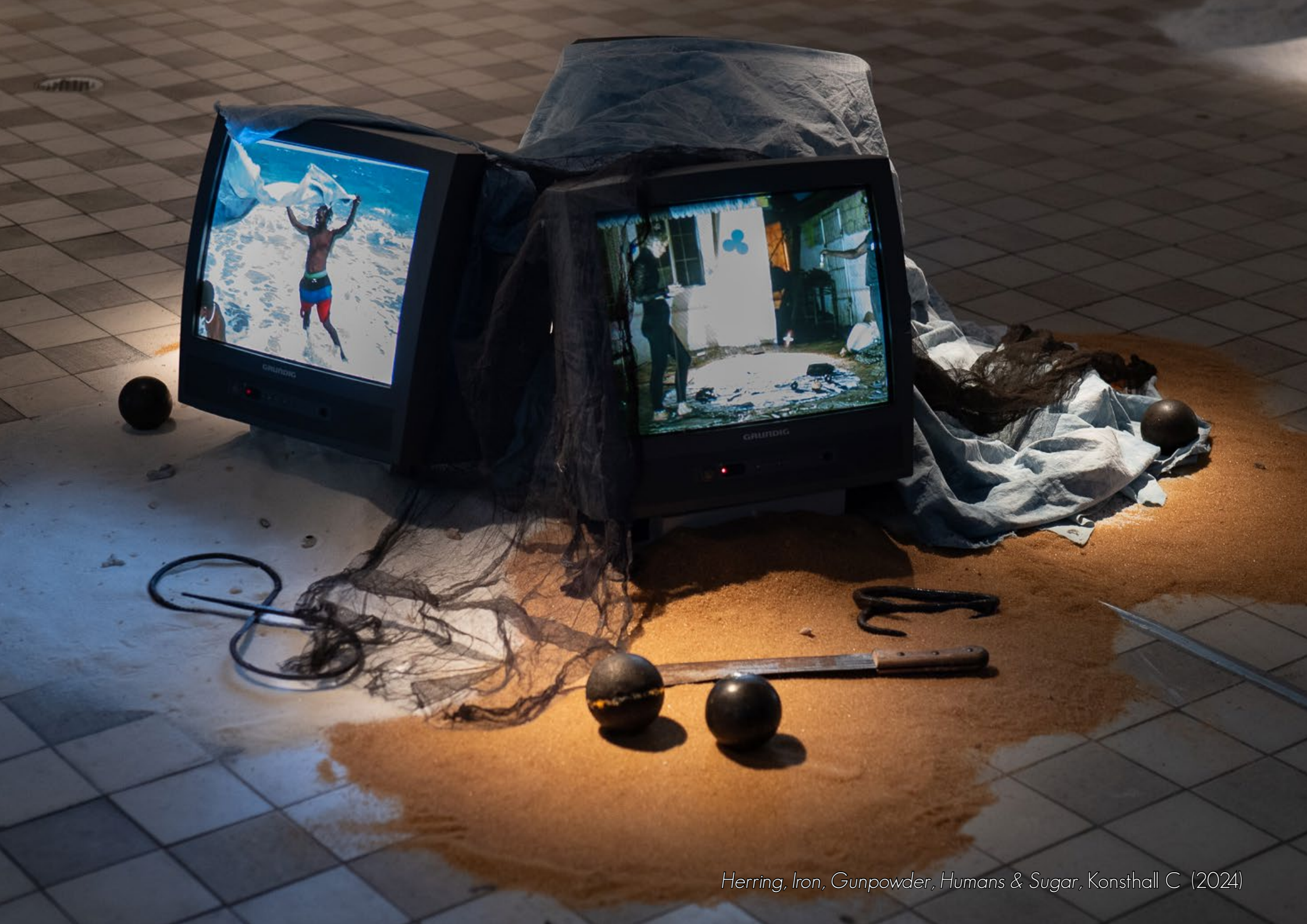
Herring, Iron, Gunpowder, Humans & Sugar, Konsthall C (2024)