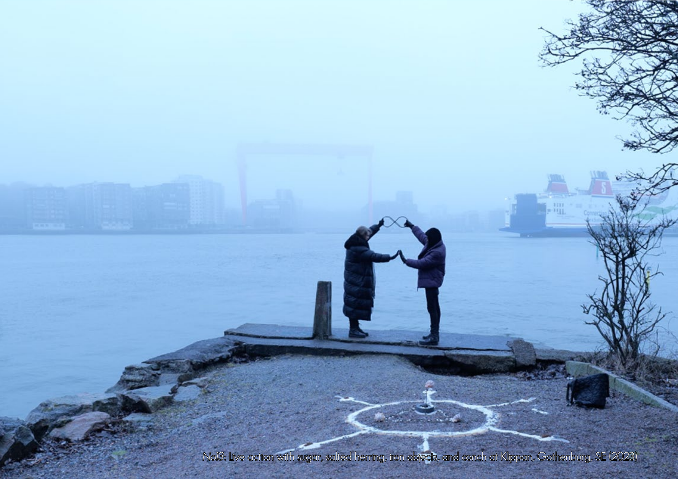
No13: Live action with sugar, salted herring, iron objects, and conch at Klippan, Gothenburg, SE (2023)