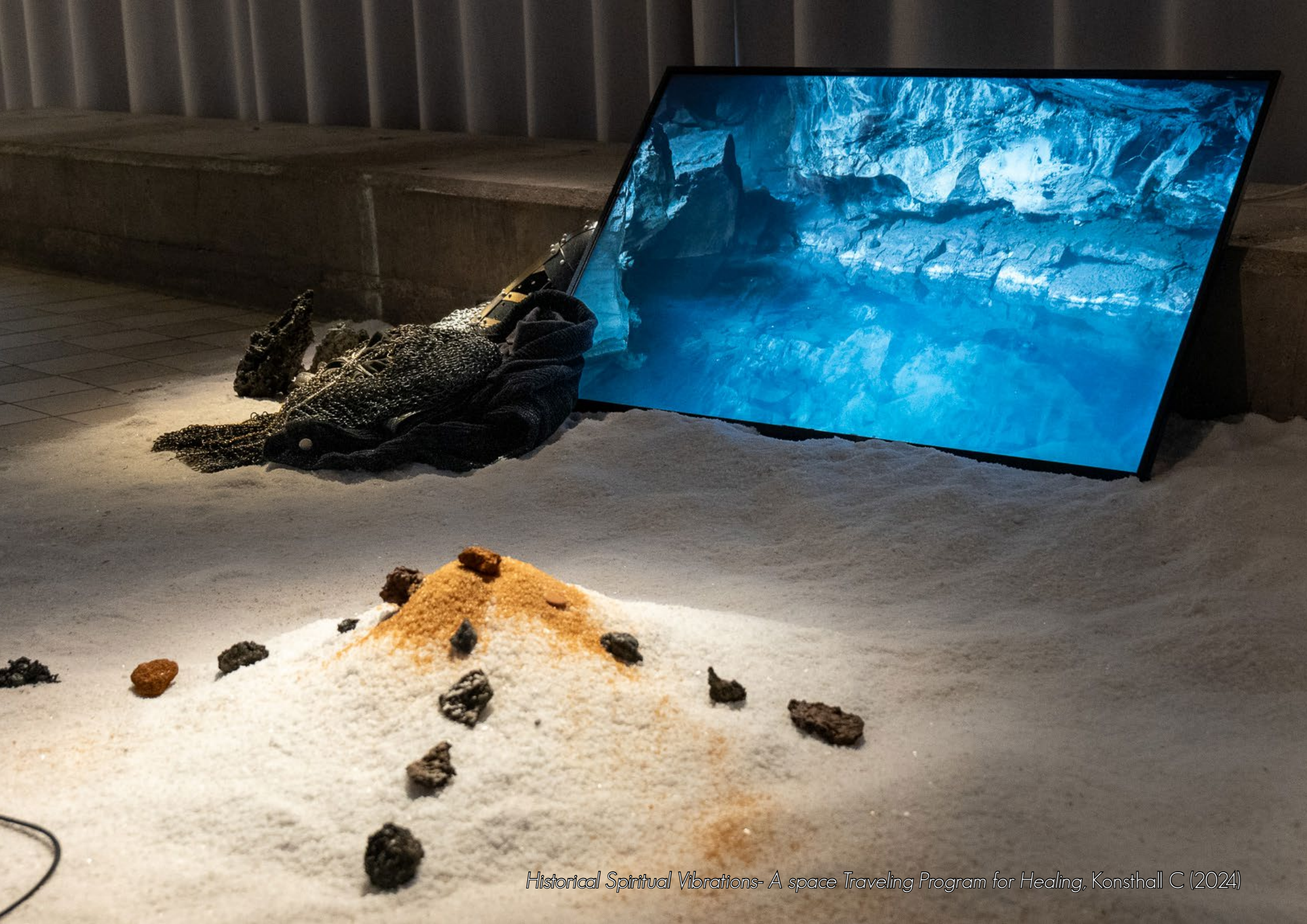
Historical Spiritual Vibrations- A space Traveling Program for Healing, Konsthall C (2024)