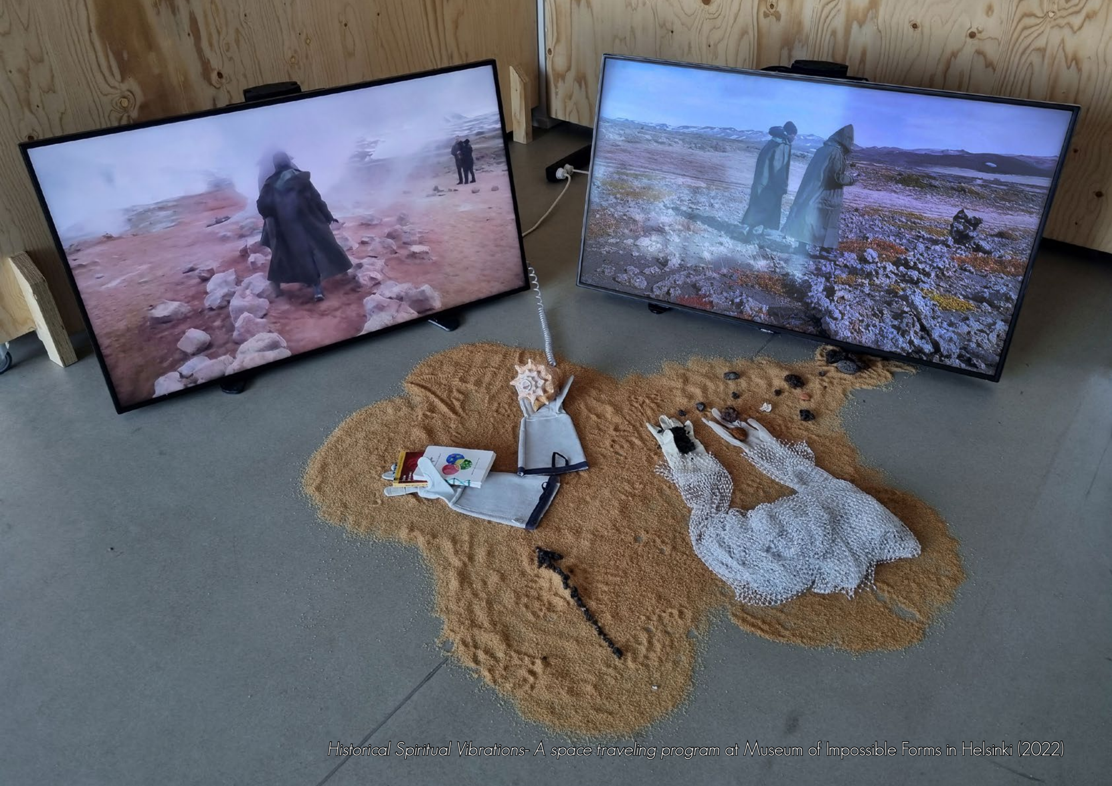
Historical Spiritual Vibrations- A space traveling program at Museum of Impossible Forms in Helsinki (2022)