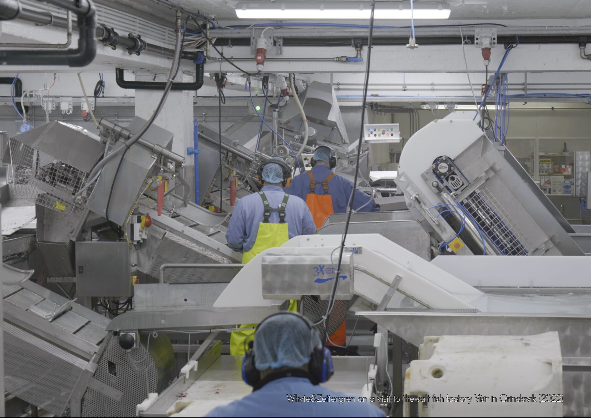
Whyte&Zettergren on a visit to the salt fish factory Vísir in Grindavík (2022)