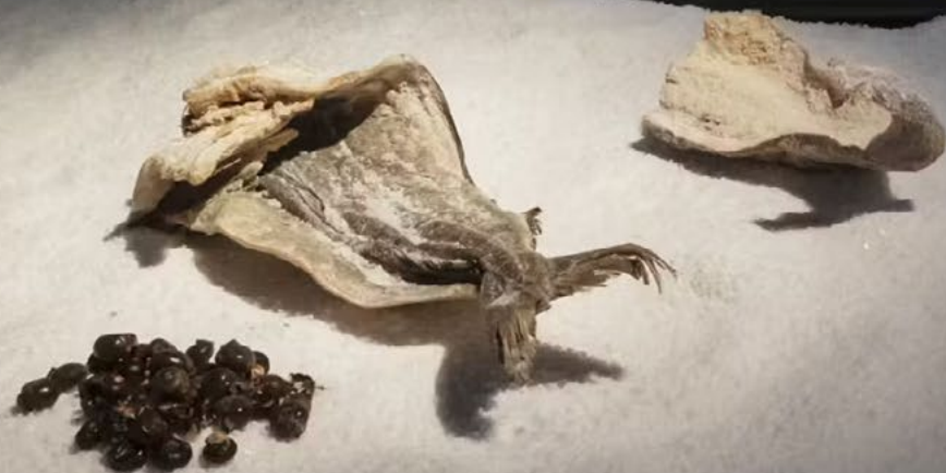
Ackee Saltfish - Atlantic oral entanglement, Konsthall C (2024)