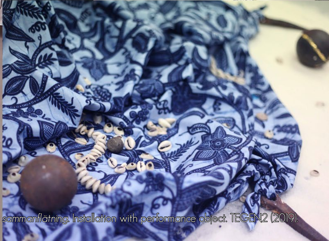
Sill, järn, krut, människor & socker - No3 Västindiska x Östindiska kompaniernas sammanflätning. Installation with performance object. TEGEN2 (2019).