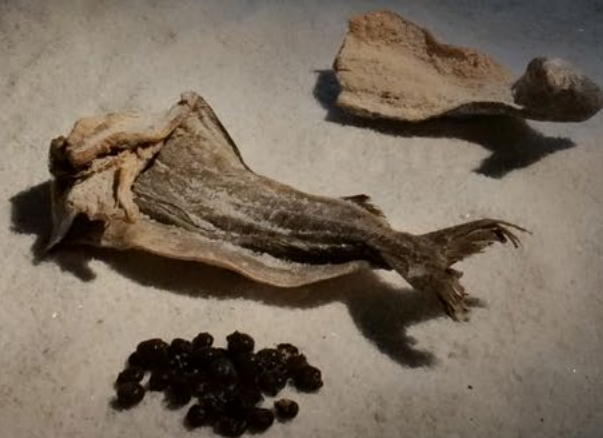
Installation view of Ackee Saltfish- Transatlantic Memories