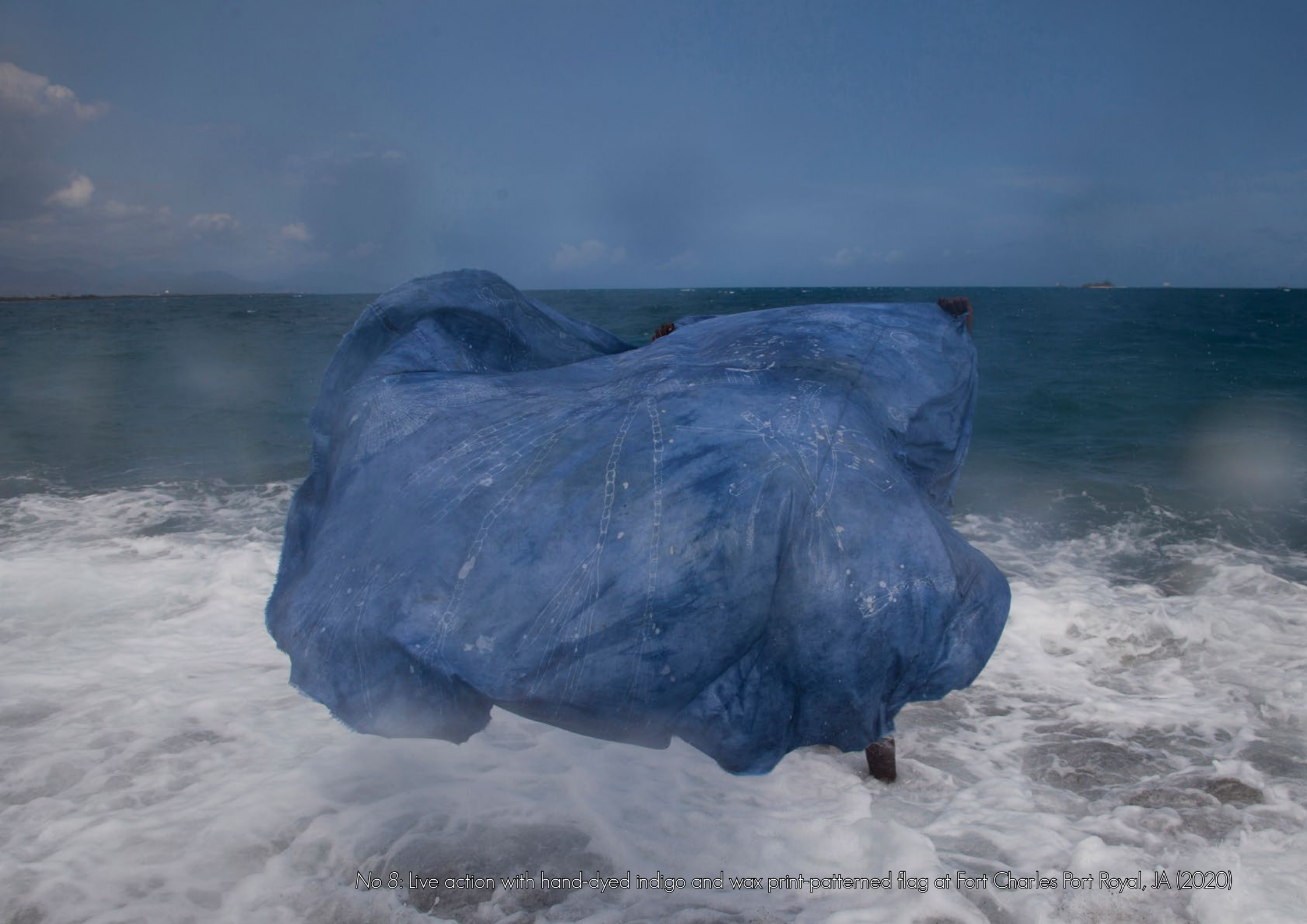
No 8: Live action with hand-dyed indigo and wax print-patterned flag at Fort Charles Port Royal, JA (2020)