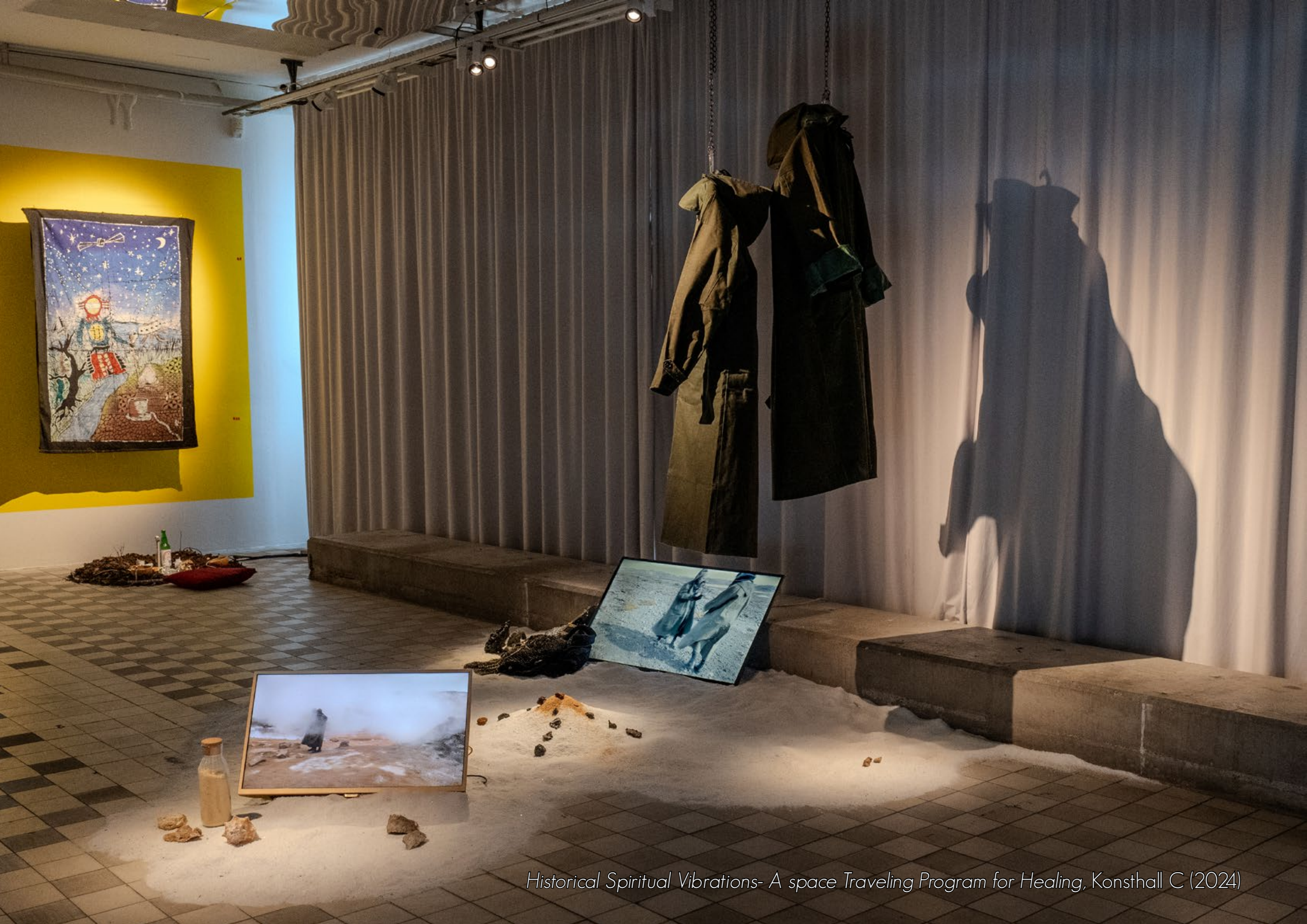
Historical Spiritual Vibrations- A space Traveling Program for Healing, Konsthall C (2024)