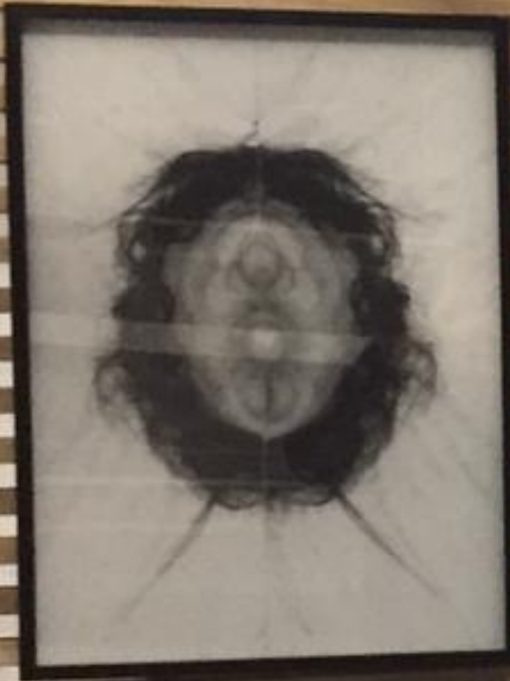
P is for Portrait, Art House Worcester (2019)