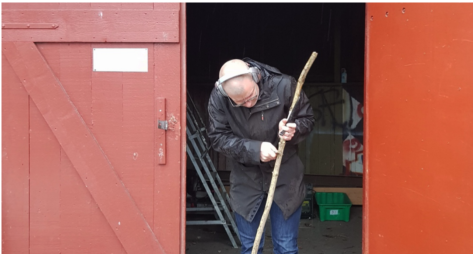
(from midterm, spikke&lytte,)

Going further, I would like to test the recorded conversations and reflections as a part of the framework in a project. Can the recordings be part of creating a shared understanding of the project?