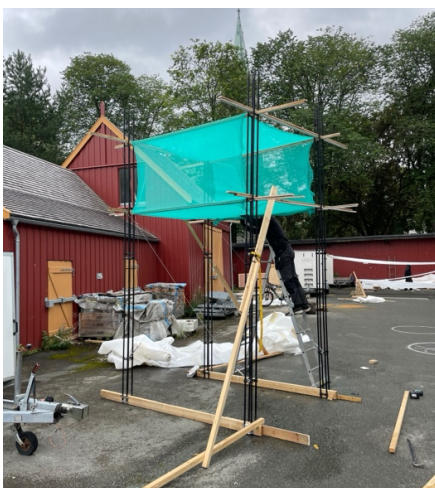
(workshop with architecture students)

One might speculate whether such instability could open possibilities for practices that embrace risk and uncertainty. If so, how might we facilitate the flourishing of small, independent initiatives?