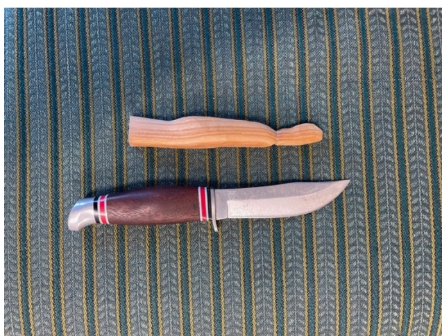
(wood carving)

Some of the recordings are short note-to-self type, while others are longer conversations where I either go for a walk, drive a car, or do wood carving. The objects I carve have eventually taken on a central place in my practice as tools for reflection and bearers of the conversations with myself.