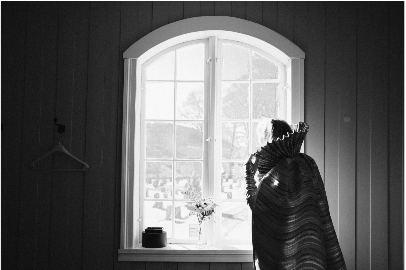
From the research travel on the countryside in my homecounty, Telemark during the pandemic times.