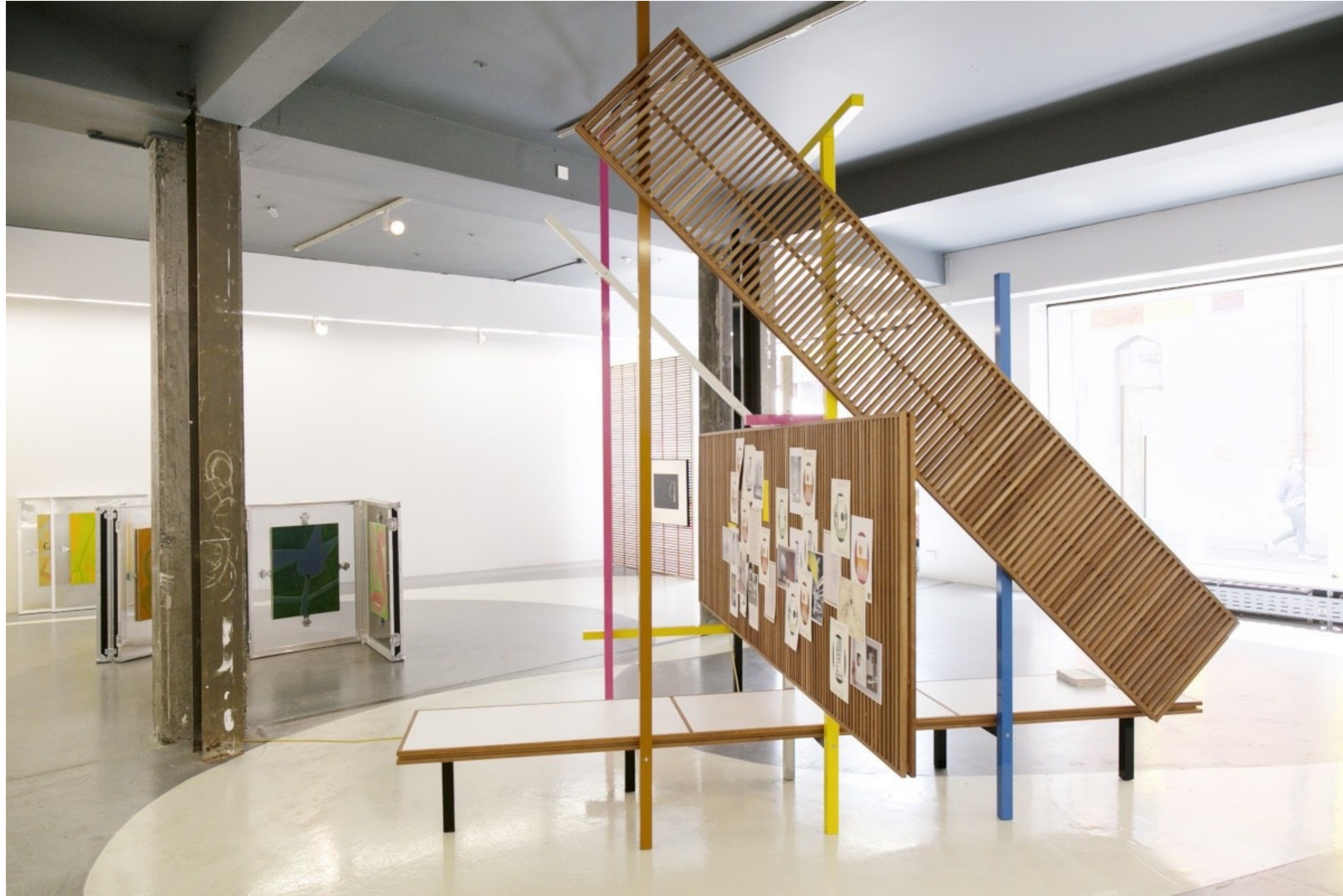
Display Show Temple Bar, Dublin 2015