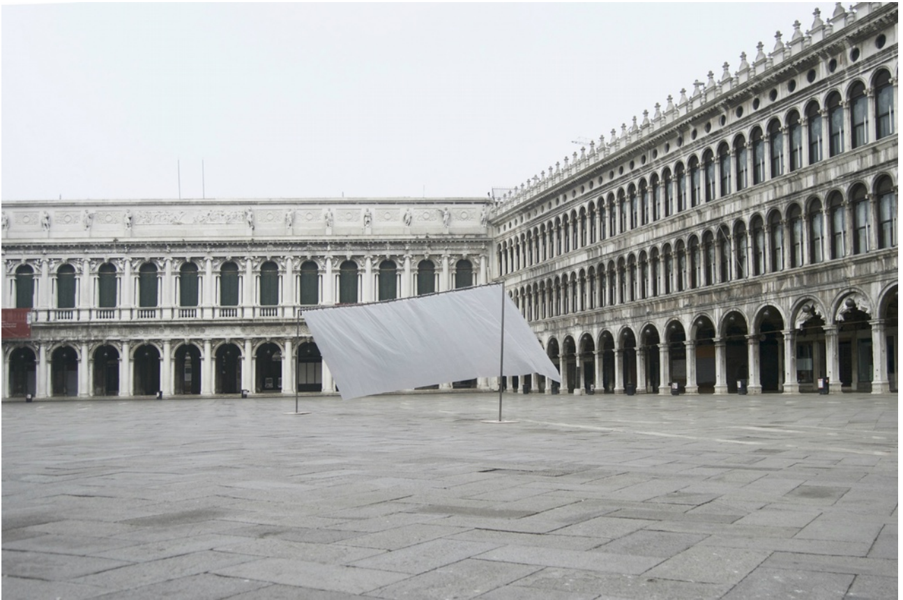
Backdrop, 2017 View of the installation, Piazza San Marco, Research Pavilion, in the context of the 57 th Venice Biennale