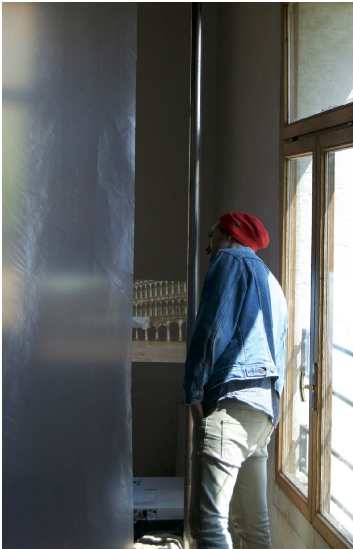
Backdrop, 2017 Visitor, view of the installation, Research Pavilion, in the context of the 57 th Venice Biennale