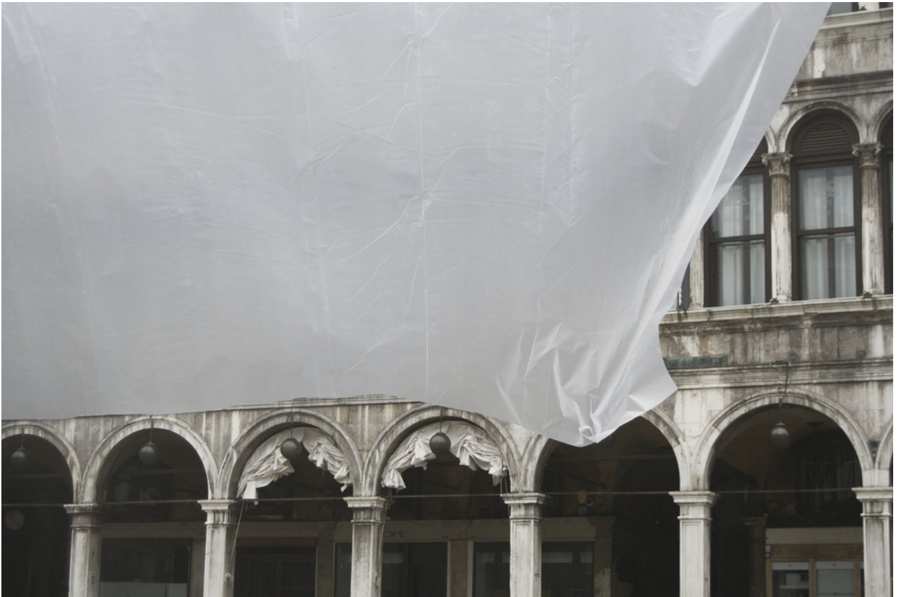
Backdrop, 2017 View of the installation, Piazza San Marco, Research Pavilion, in the context of the 57 th Venice Biennale