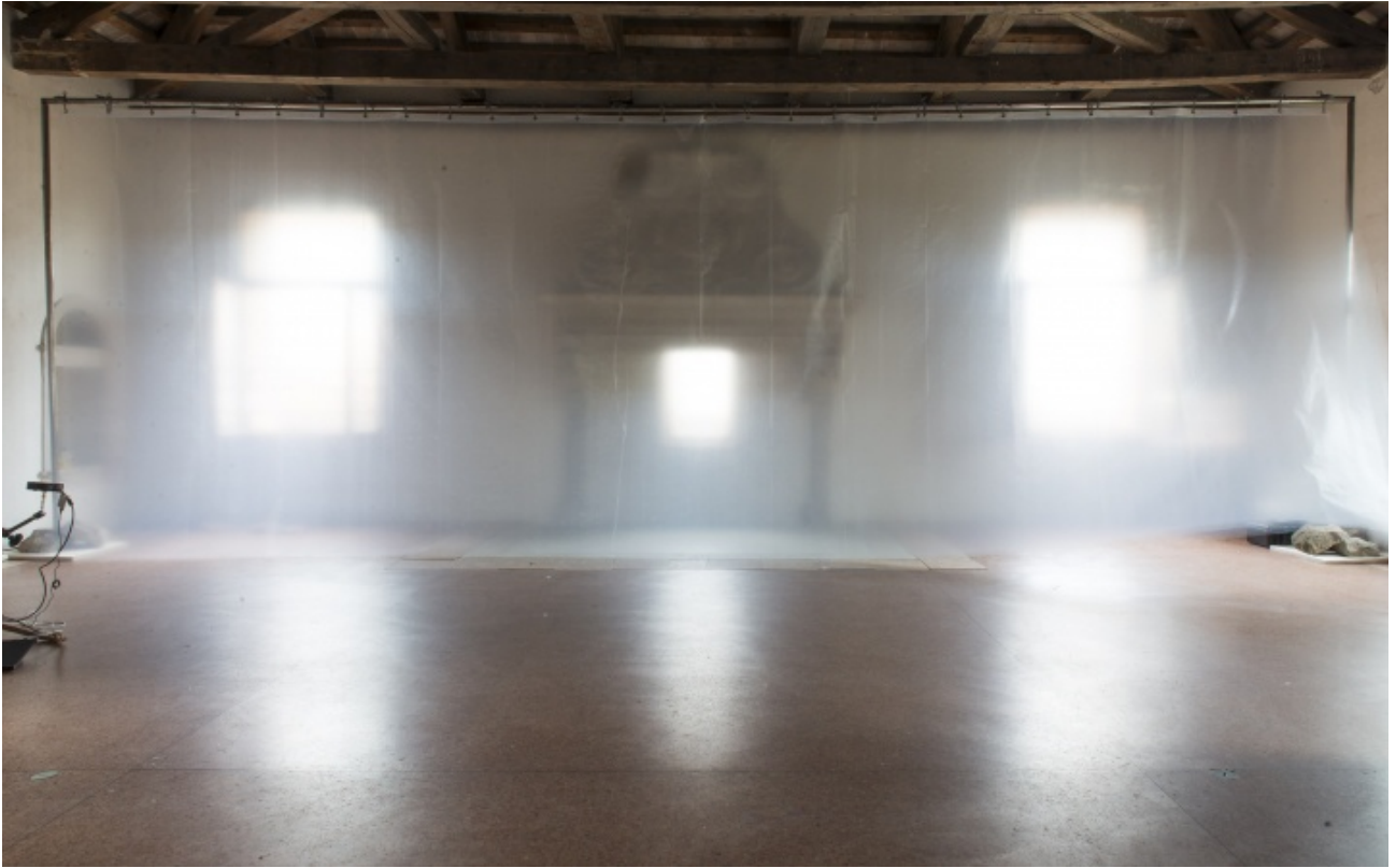
Backdrop, 2017 View of the installation, Research Pavilion, in the context of the 57 th Venice Biennale