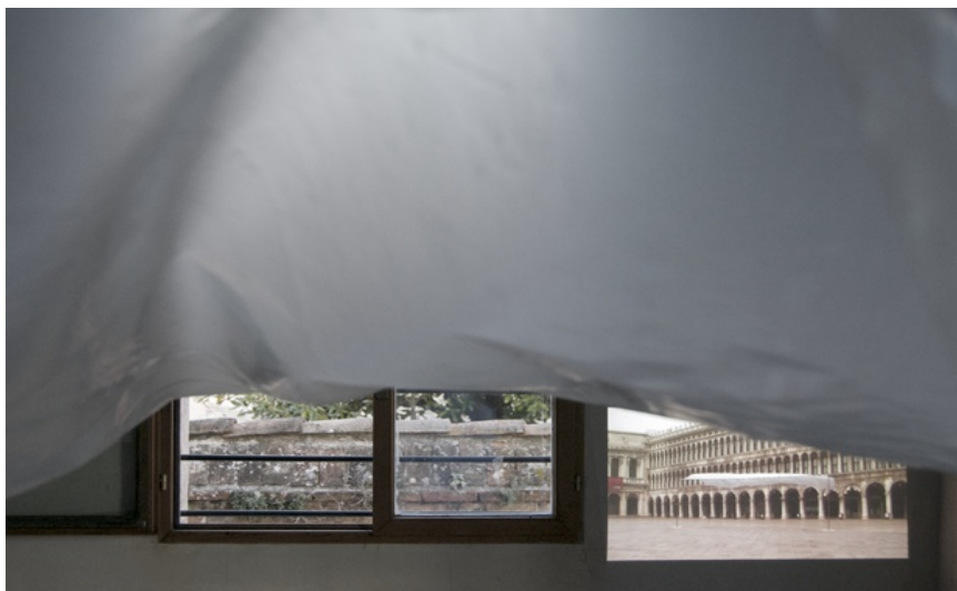
Backdrop, 2017 View of the installation & video (colour/sound/2'/loop), Research Pavilion, in the context of the 57 th Venice Biennale