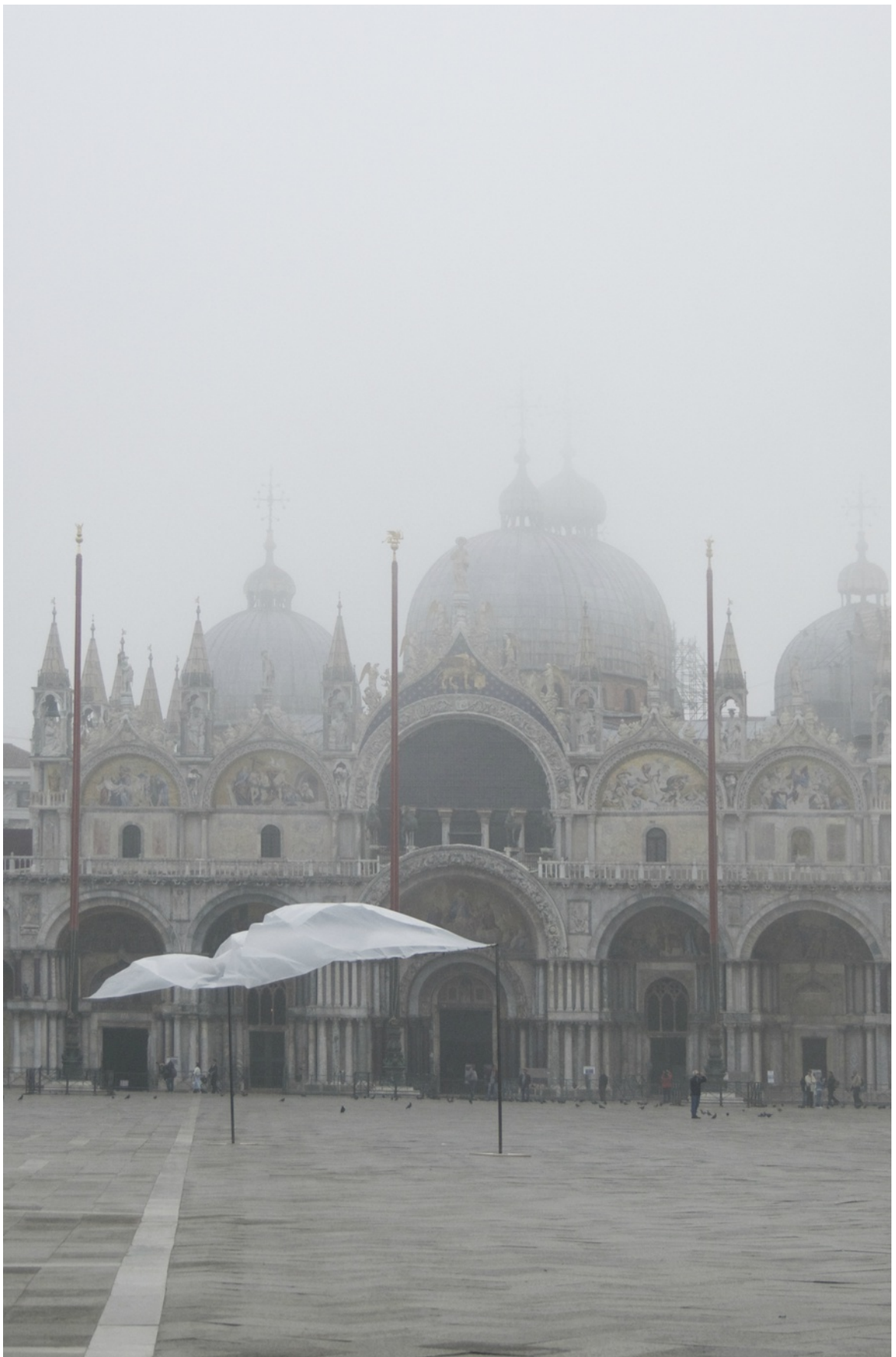
Backdrop, 2017 View of the installation, Piazza San Marco, Research Pavilion, in the context of the 57 th Venice Biennale