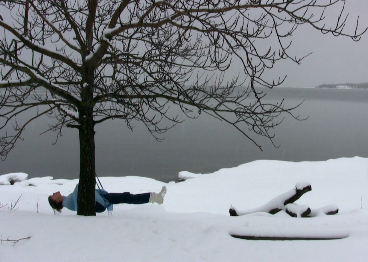
Year of the Snake – In the Swing (2014) video still