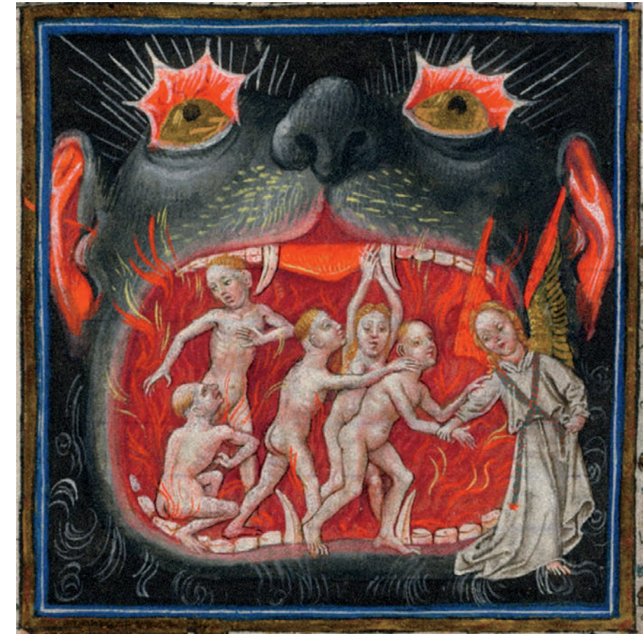
“Hellmouth” miniature from The Hours of Catherine of Cleves , c. 1440

Although modern consumerism is tied to recent shifts in the dynamics of capitalist society, its foundations in the Americas can be found in the earliest encounters with Europeans, whose competitive, self-centred drives to extract maximum profit from the natural resources of the “New World” set the pattern for what continues today. After the founding of the Hudson’s Bay Company in 1670, the British established settlements along