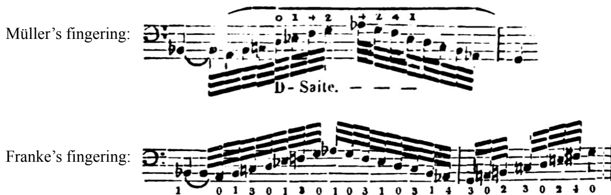
Figure 5. Fingerings for Beethoven, Symphony no. 3, movt. 1, mm. 16 - 17. 82