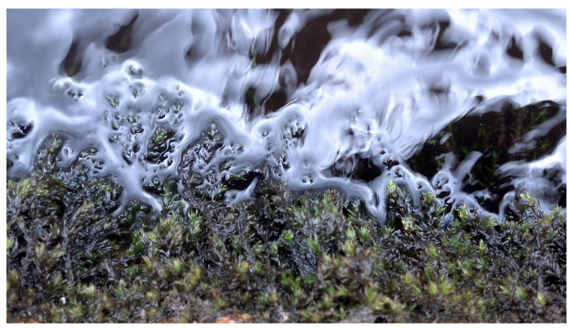
Glenade Water and Moss from Water Senses, 2016 © Ruth Le Gear

7<sup>th</sup> – 9<sup>th</sup> June 2019