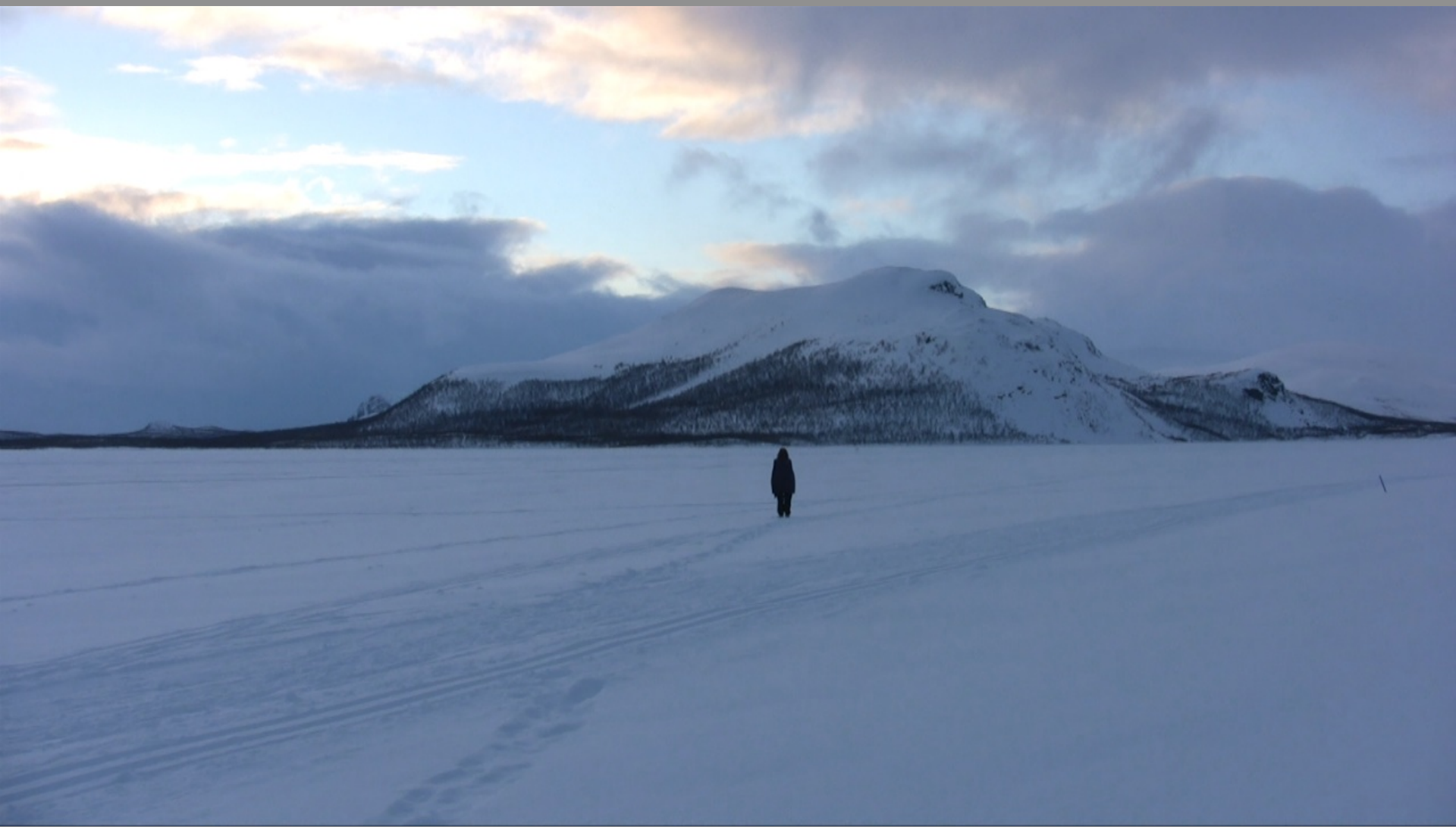
Meeting Malla, video still 5