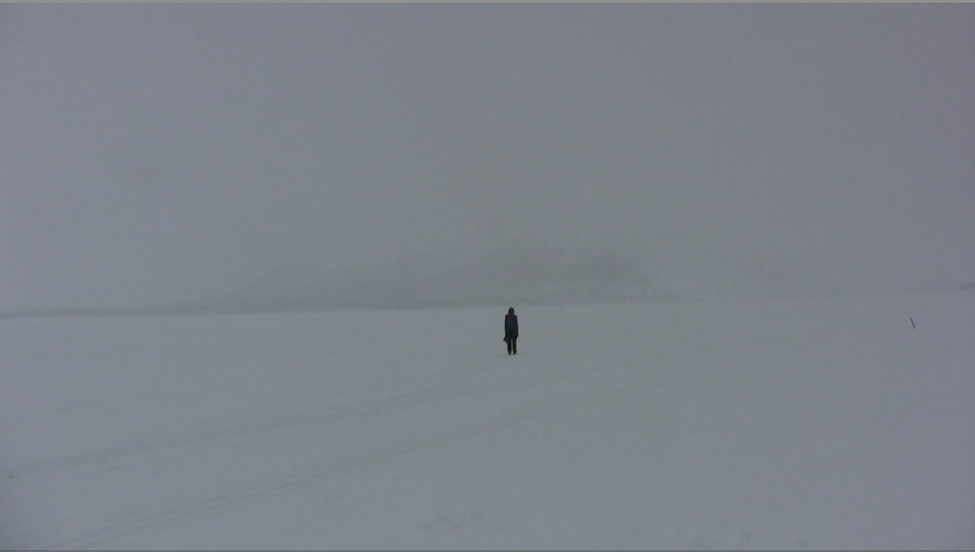
Meeting Malla, video still 11