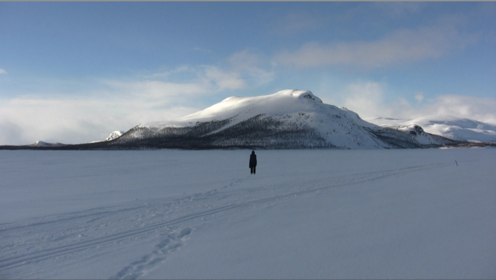
Meeting Malla, video still 3