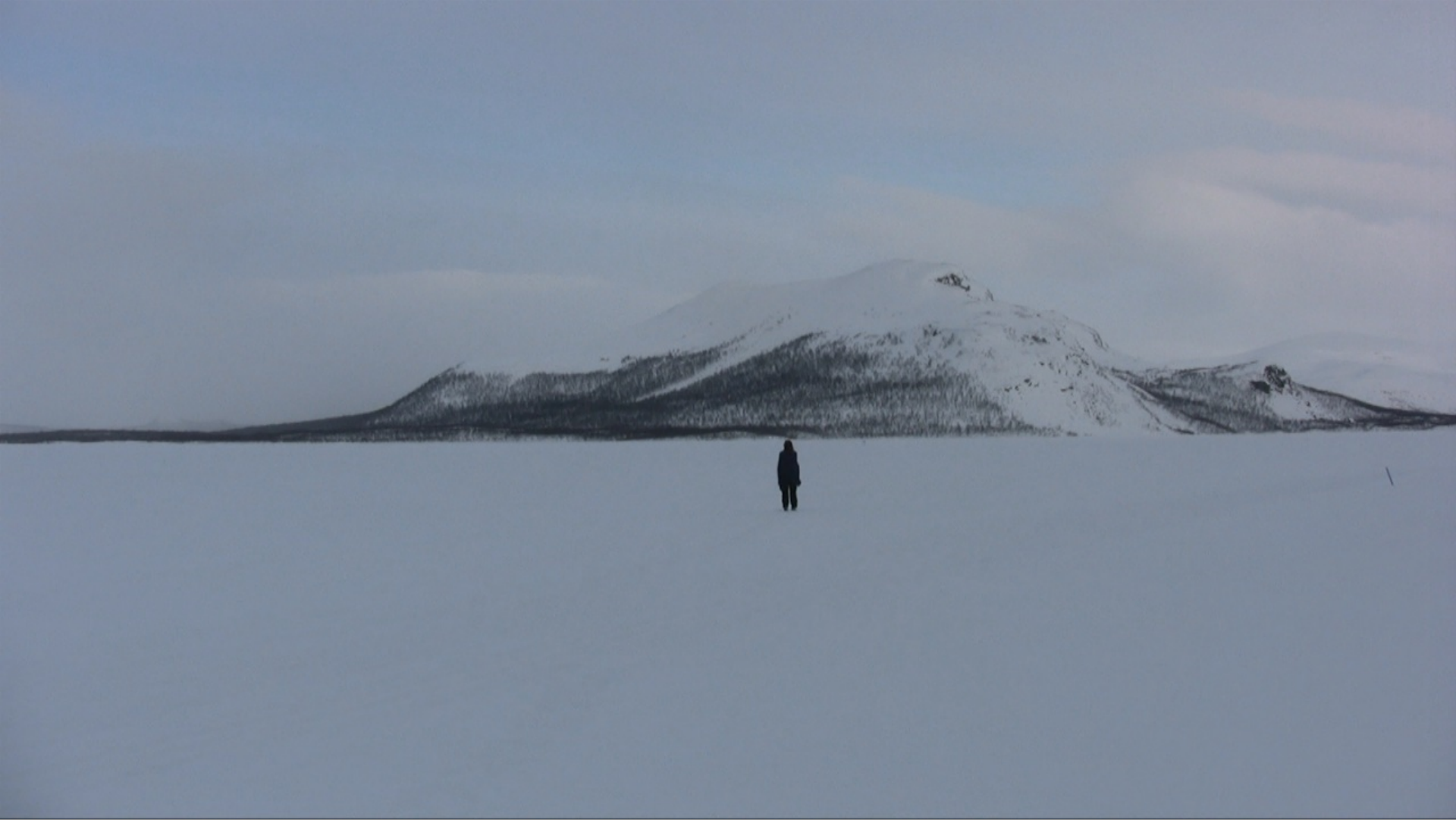
Meeting Malla, video still 6