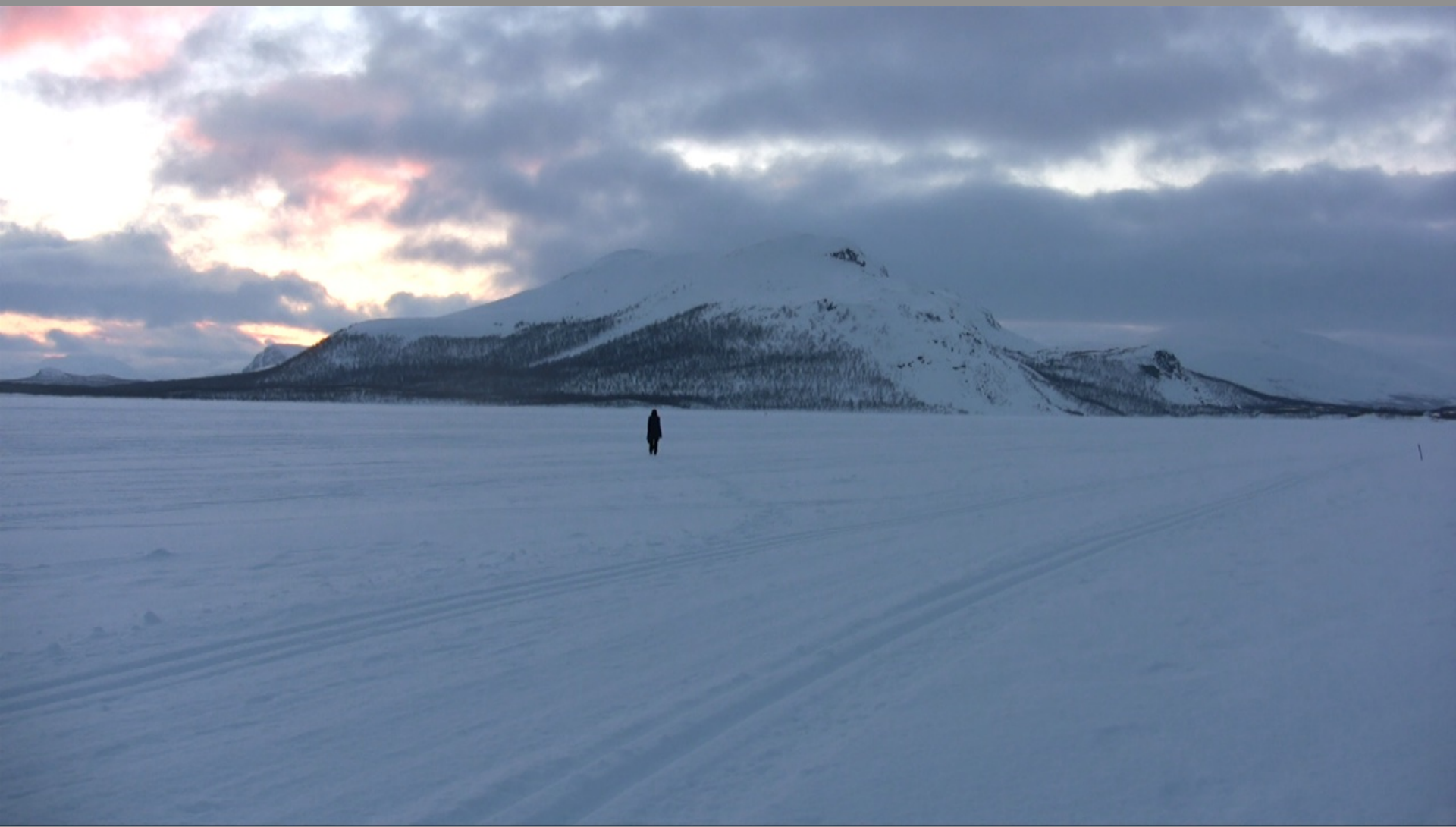
A Day with Malla 1, video still 8