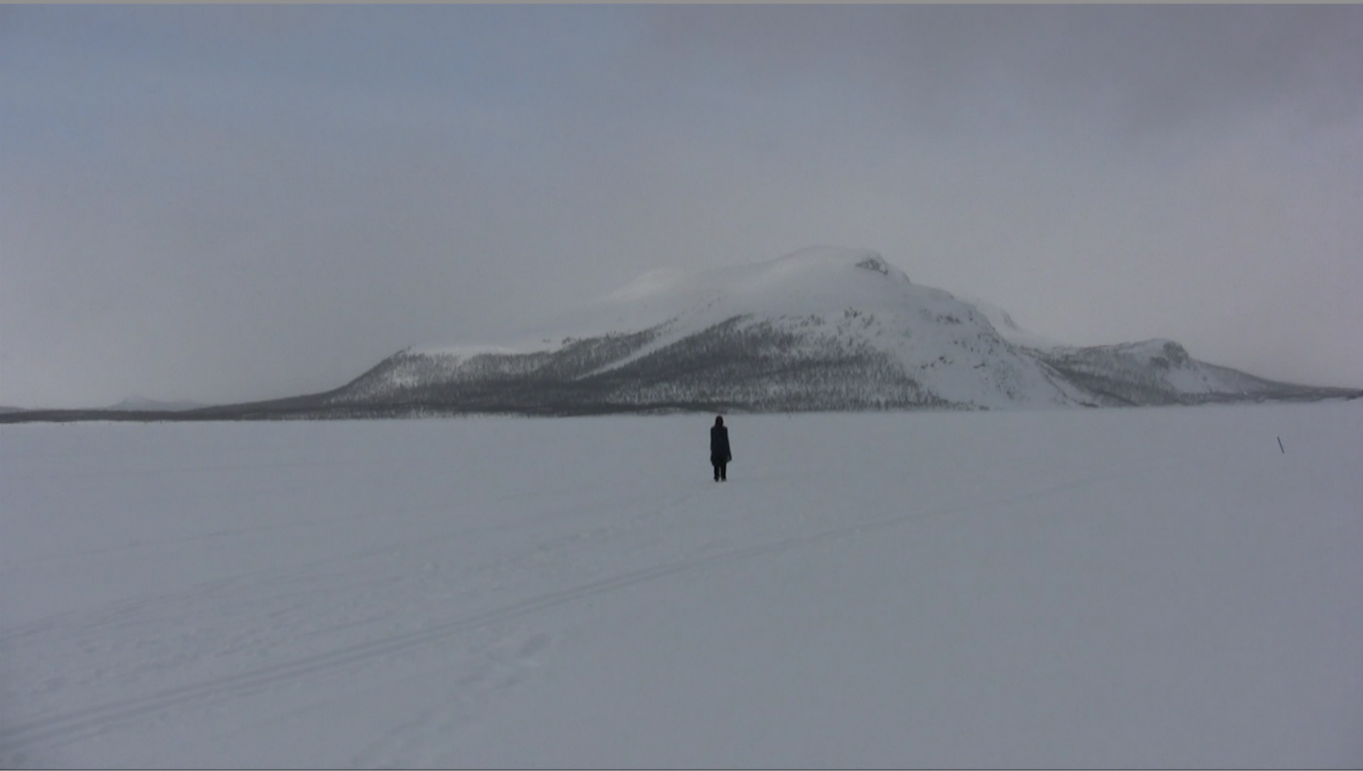
Meeting Malla, video still 8