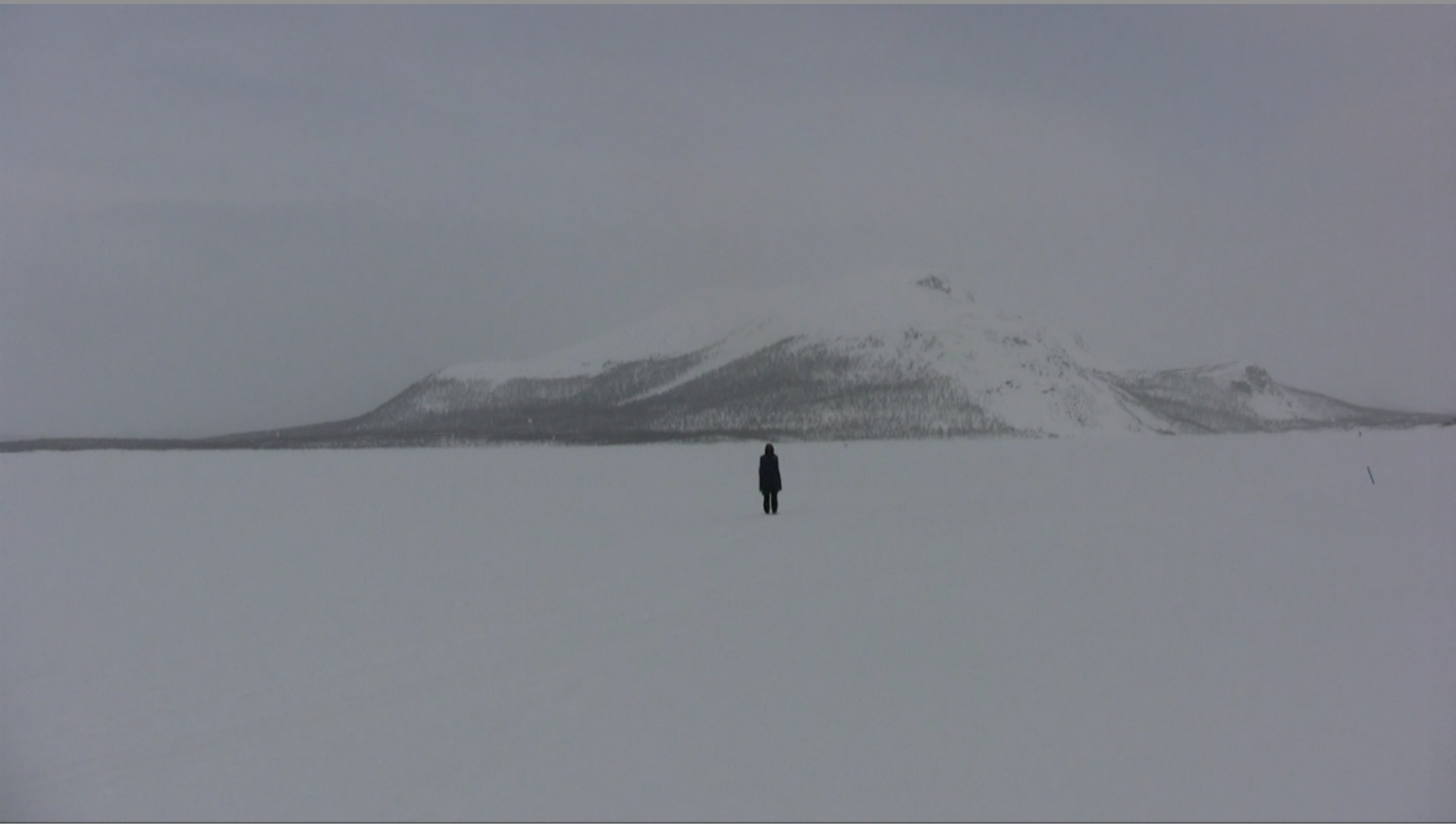
Meeting Malla, video still 7