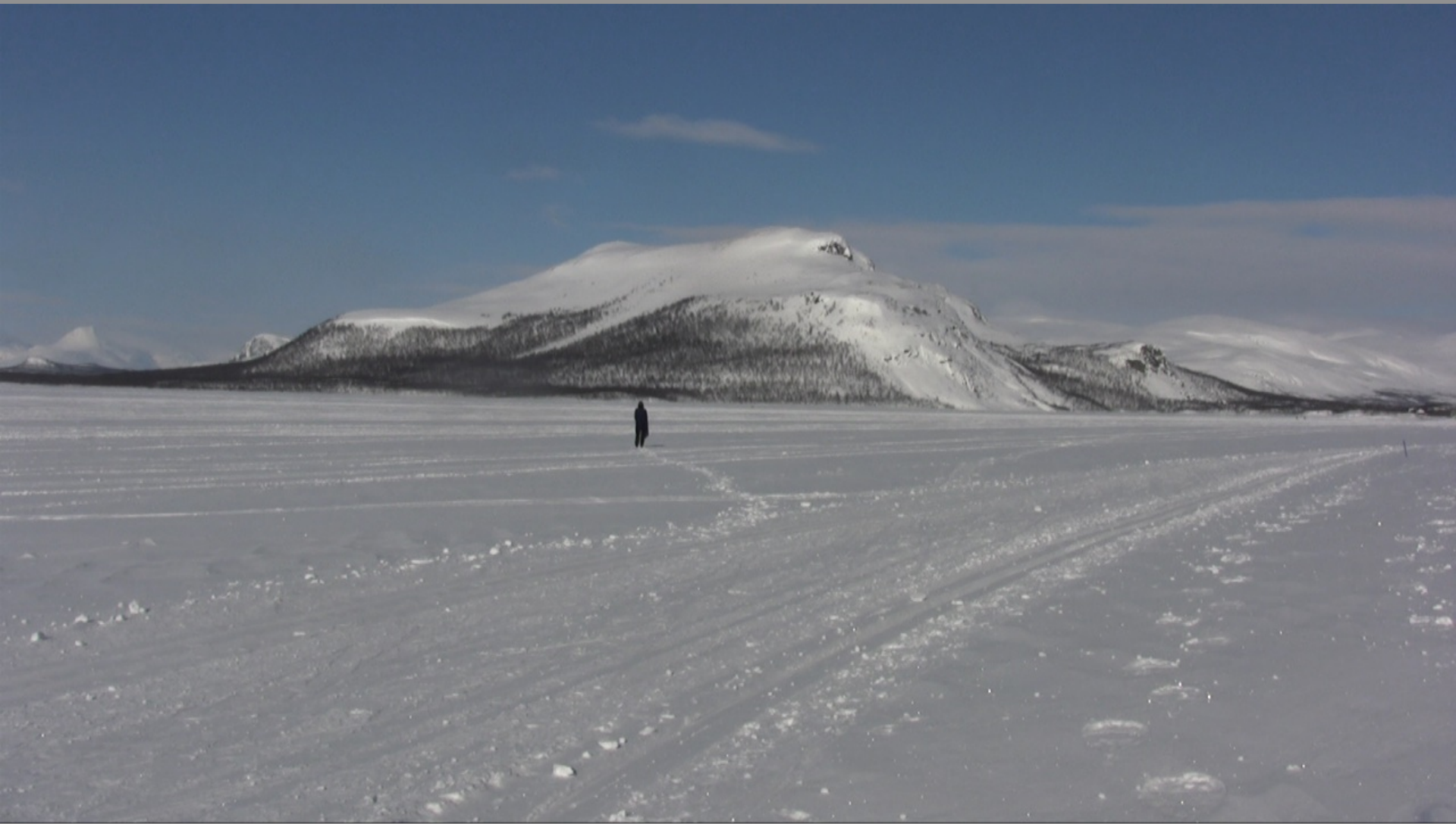
A Day with Malla 1 , video still 3