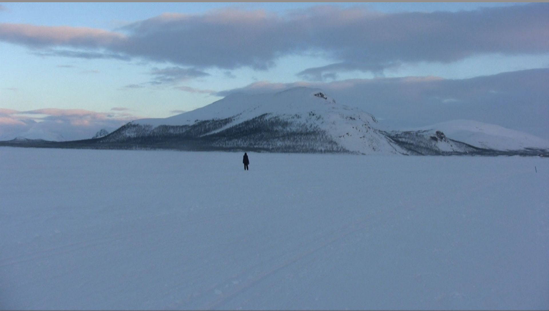
A Day with Malla 1, video still 1