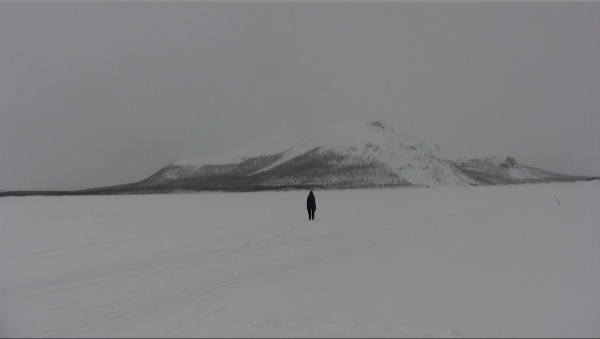
Meeting Malla, video still 10