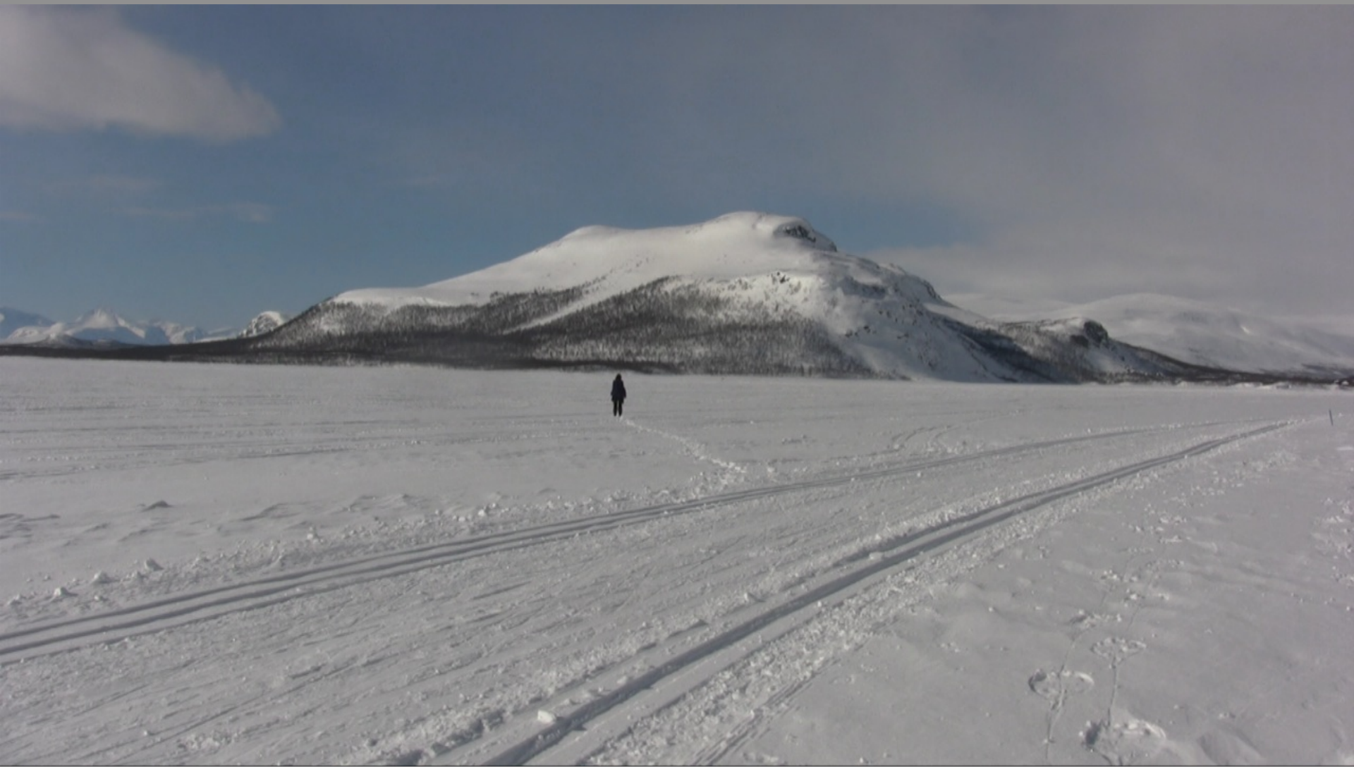
A Day with Malla 1 , video still 5