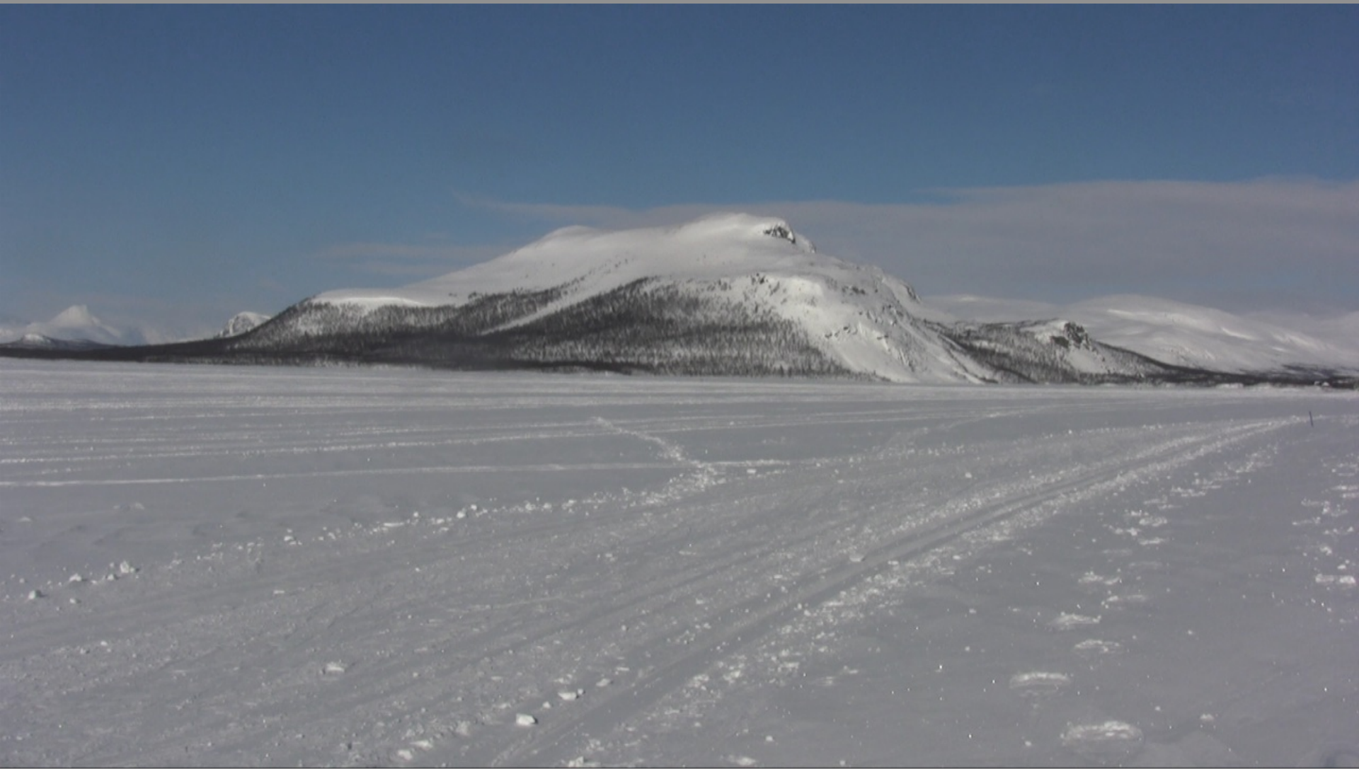
A Day with Malla 2, video still 3