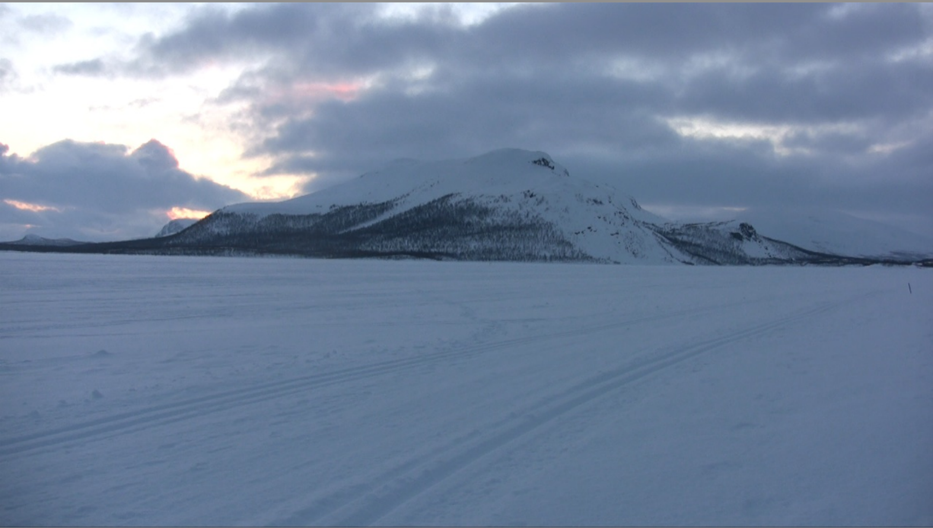
A Day with Malla 2, video still 8