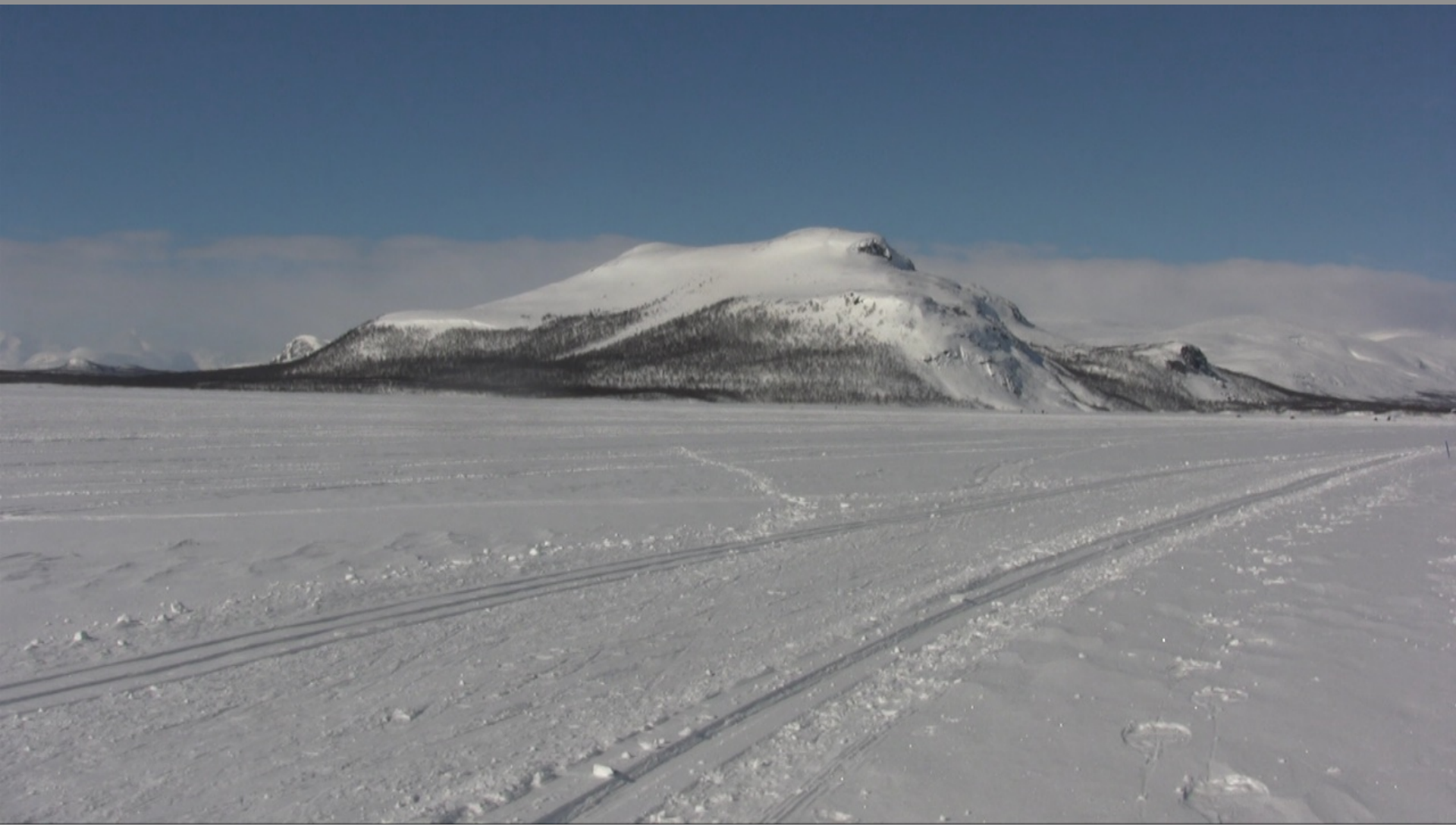
A Day with Malla 2, video still 4