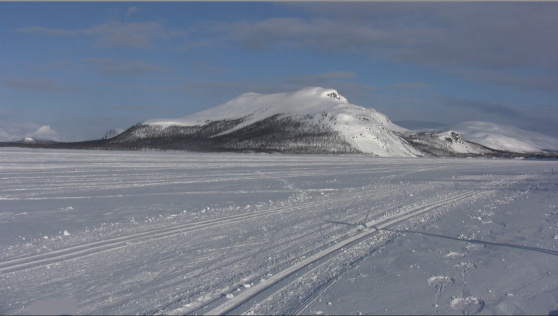
A Day with Malla 2, video still 2