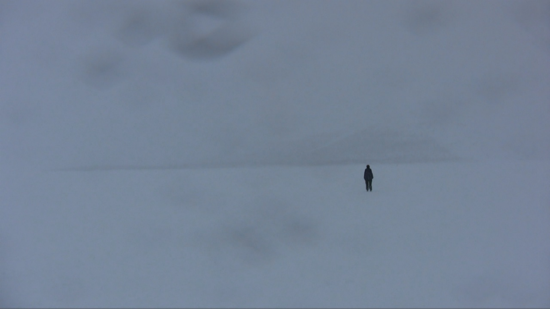
Meeting Malla, video still 12