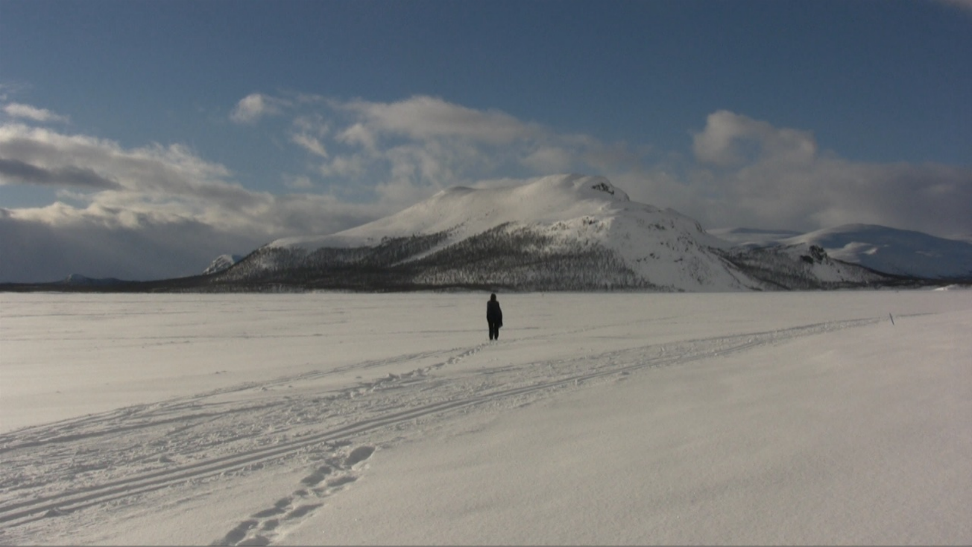
Meeting Malla, video still 4