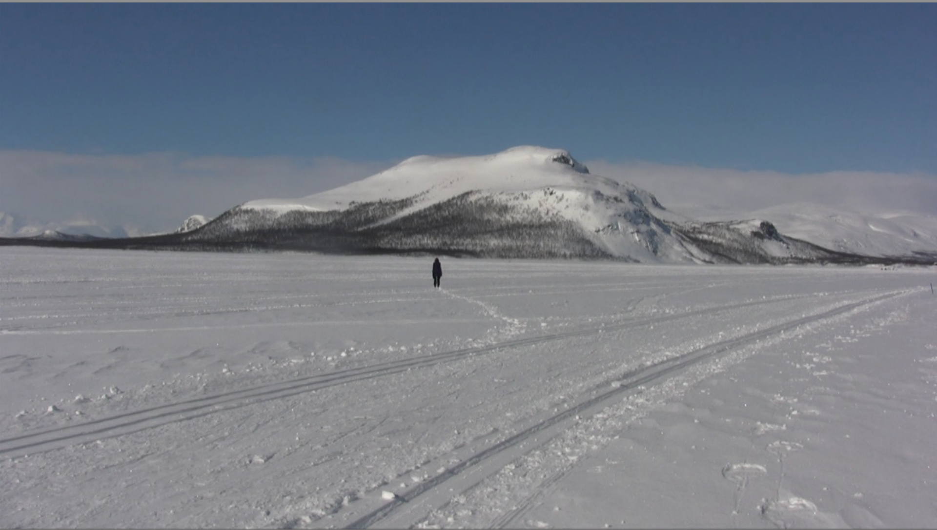
A Day with Malla 1 , video still 4