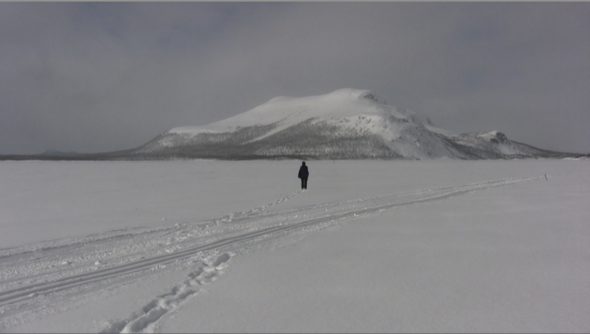
Meeting Malla, video still 2