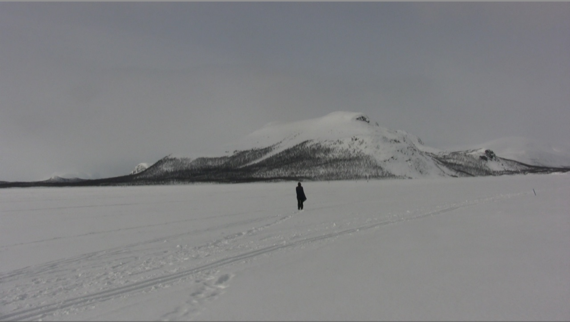
Meeting Malla, video still 9