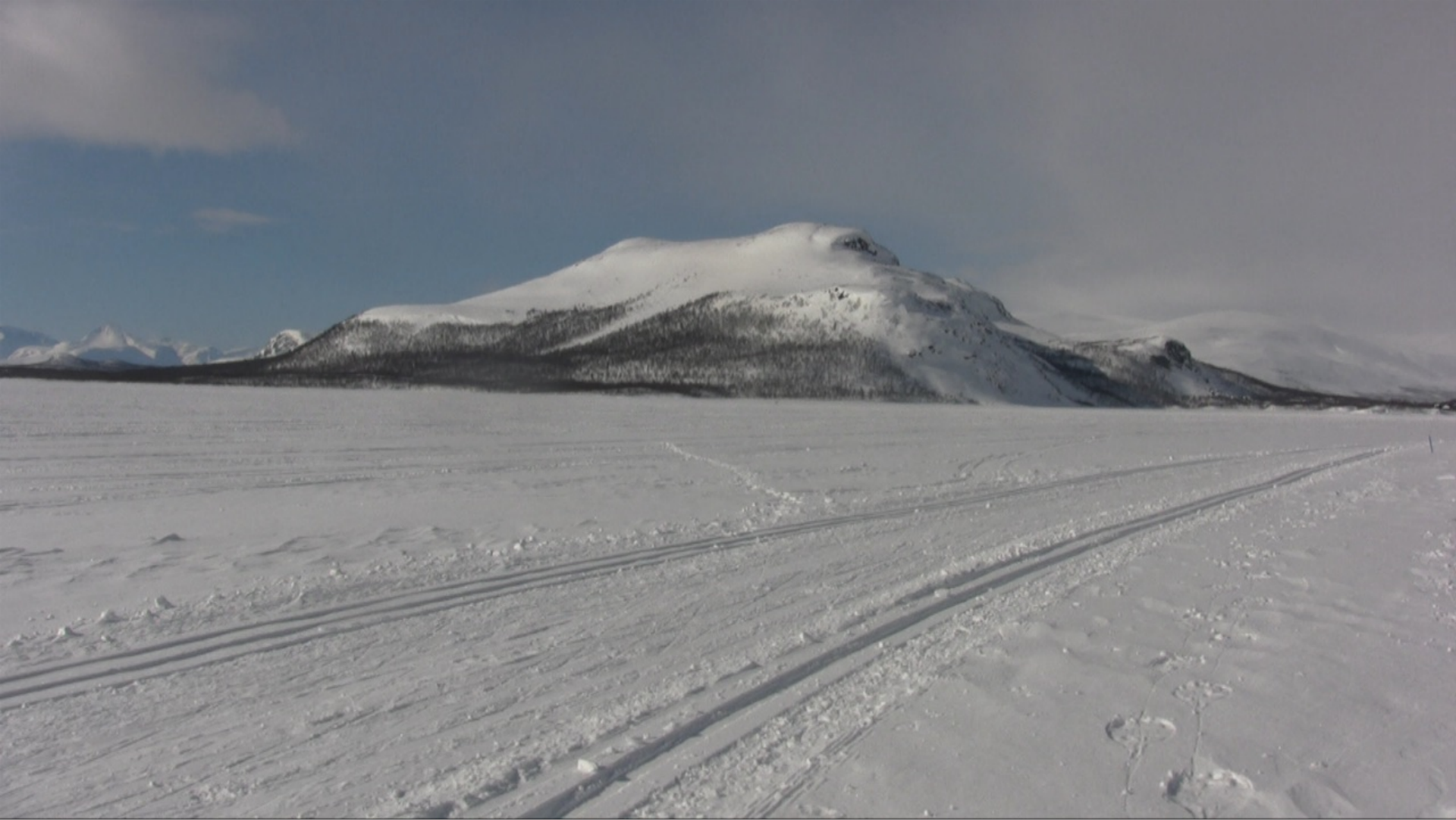
A Day with Malla 2, video still 5