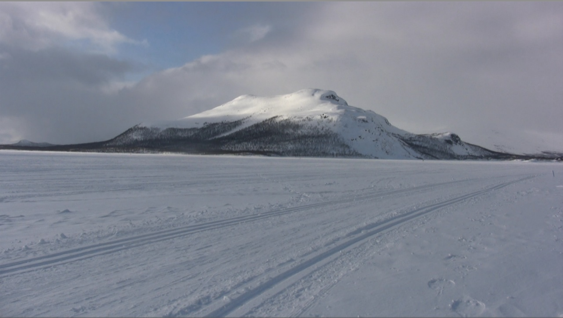
A Day with Malla 2, video still 6