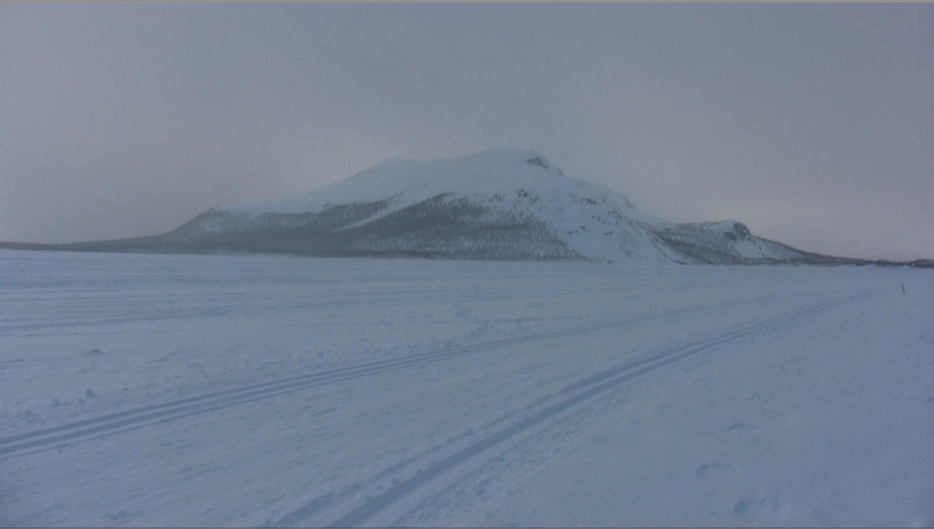
A Day with Malla 2, video still 7