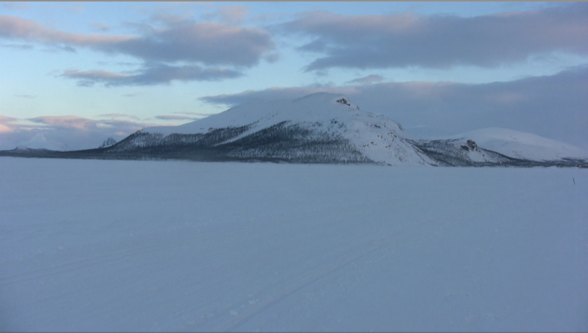
A Day with Malla 2, video still 1