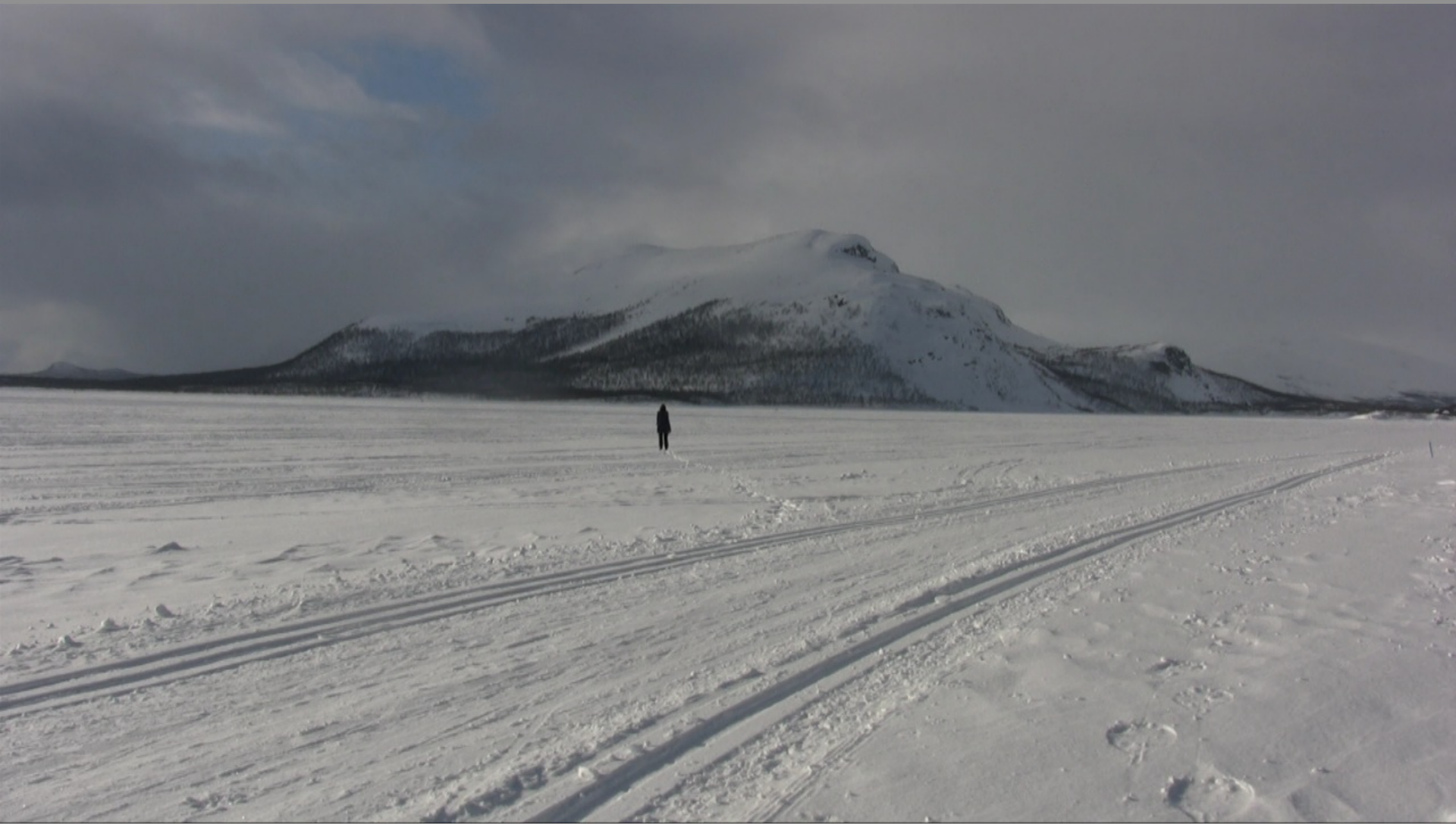
A Day with Malla 1, video still 6