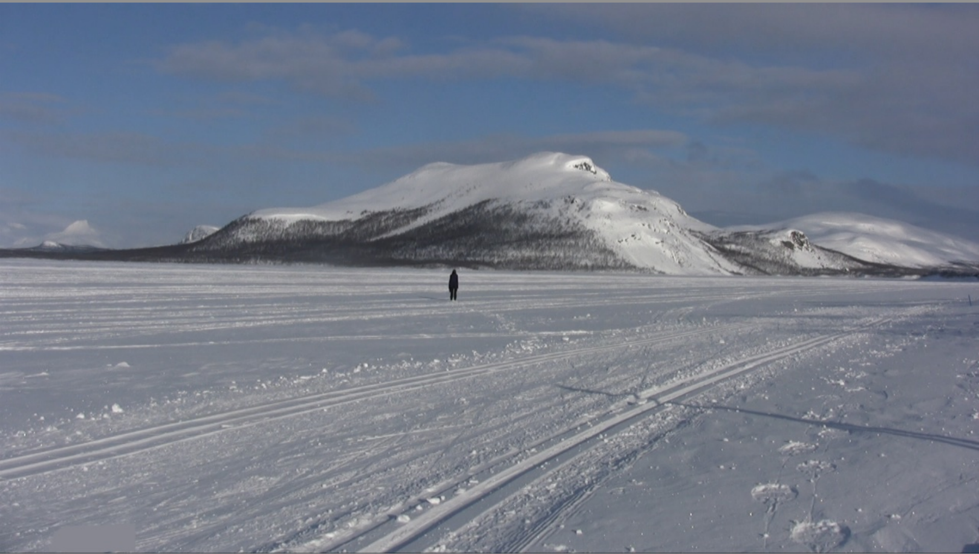
A Day with Malla 1, video still 2