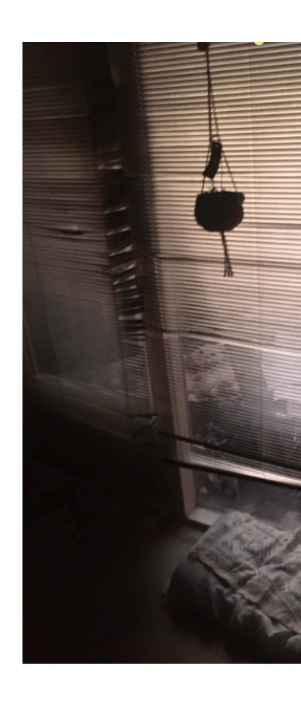
The Light through my bedroom window, Utrecht, Winter 2019